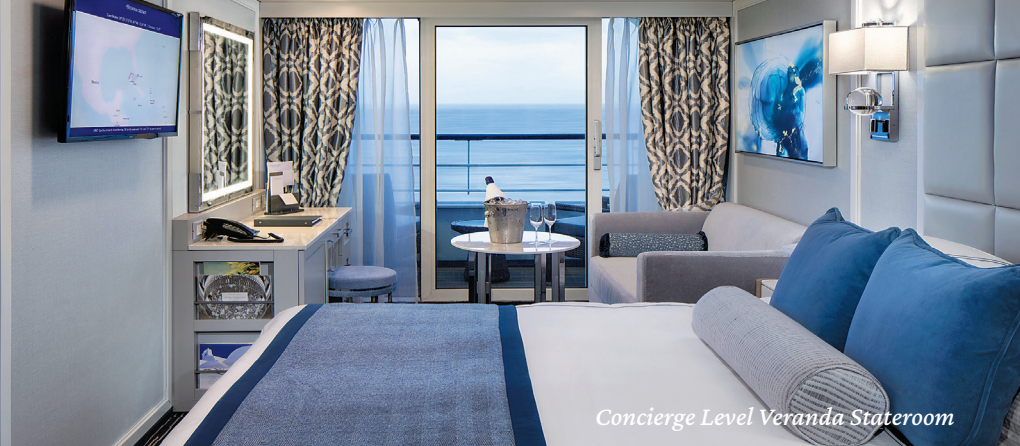
Concierge Level Veranda Stateroom