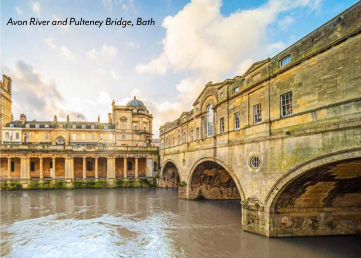
Avon River and Pulteney Bridge, Bath