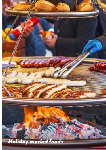
Holiday market foods