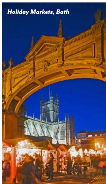
Holiday Markets, Bath