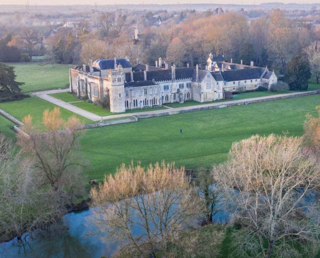
Above: Lacock Abbey, Lacock, Wiltshire Cover: London Tower Bridge

Photo Credits: Alamy, AdobeStock, Shutterstock, ©Visit West, No.1 Royal Crescent – Bath Preservation Trust; all images are rights managed and cannot be used without permission.