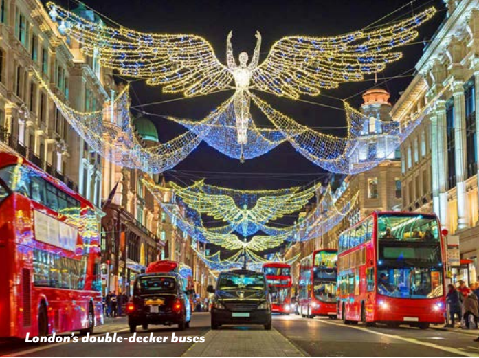
London's double-decker buses