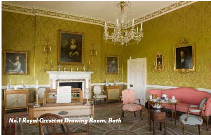
No. 1 Royal Crescent Drawing Room, Bath

The rooms sparkle with festive greenery and twinkling lights, creating a warm holiday glow, while outside, a magnificent