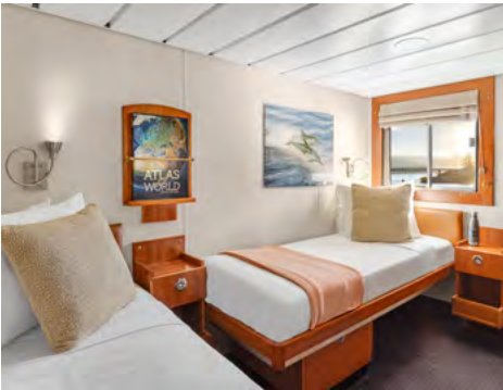
Category 2 cabin with single beds.

All cabins face outside with windows, private facilities, and climate controls. Cabins are equipped with Wi-Fi and multiple electrical and USB outlets. Botanically inspired shampoo, conditioner, shower gel and lotion are all available in cabin bathrooms, as well as an Expedition Essentials Kit. Hair dryers, complimentary insulated water bottles and an atlas are available in each cabin.