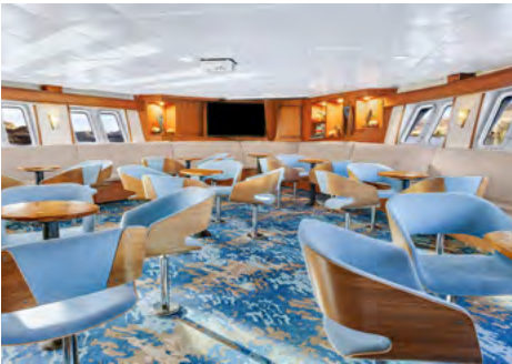
The lounge is the center of life aboard the ship.

Served in single seatings with unassigned tables for an informal atmosphere. Menu emphasizes local fare.