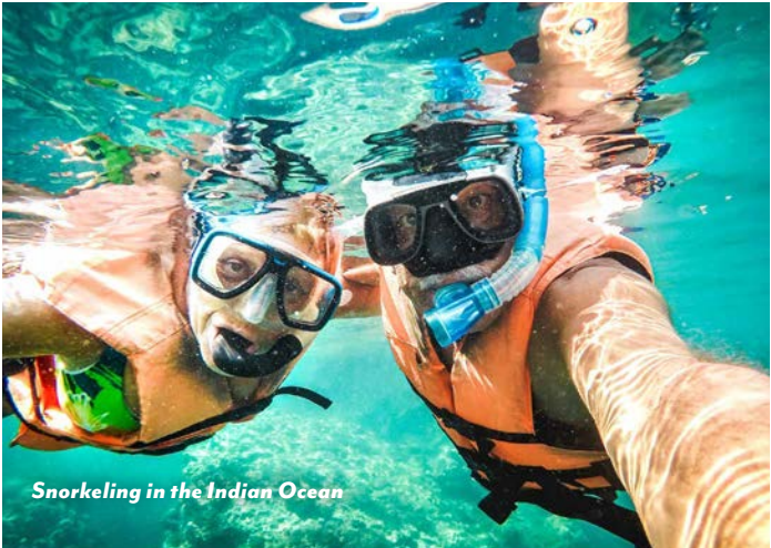
Snorkeling in the Indian Ocean

Remire Island Remire Island boasts unique biodiversity. On a guided walk through the island's lush vegetation, observe diverse wildlife, including endemic birds and reptiles.