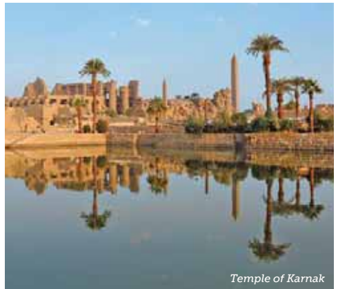
Temple of Karnak