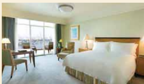
Four Seasons Hotel Cairo at Nile Plaza | Cairo