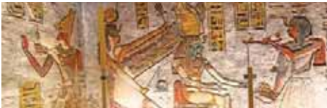
Hieroglyphics, Valley of the Kings