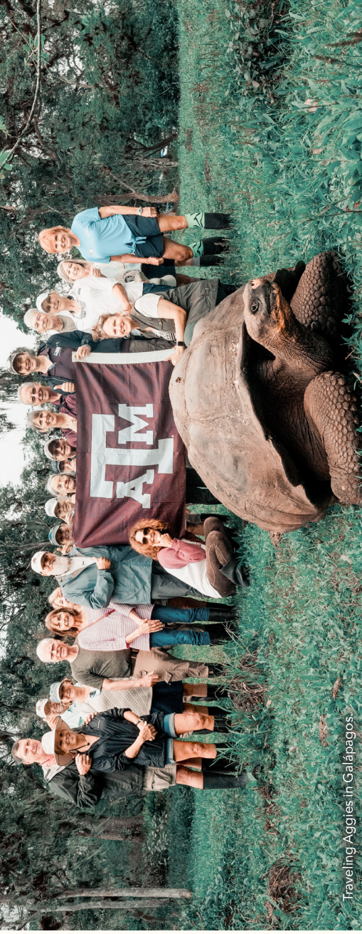
Traveling Aggies in Galápagos.

Printed on 100% recycled content paper with soy-based inks. We recommend that you pass this along for others to enjoy or recycle.