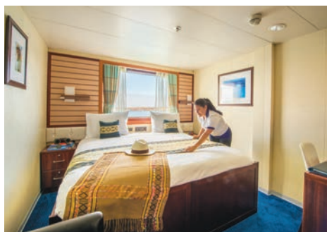
Comfortable Category 4 cabin.

Cabins and suites face outside with large windows and feature twin beds that convert to a queen. With private facilities, climate control, nightstands, desk, and storage. Seven sets of cabins with a connecting door and nine solo cabins.