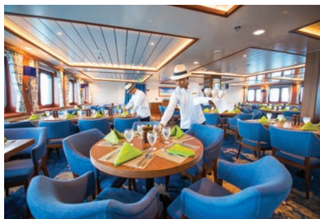
The casual dining room.

Served in single, unassigned seating in a sociable, informal atmosphere. Menu emphasizes Ecuadorian flair.