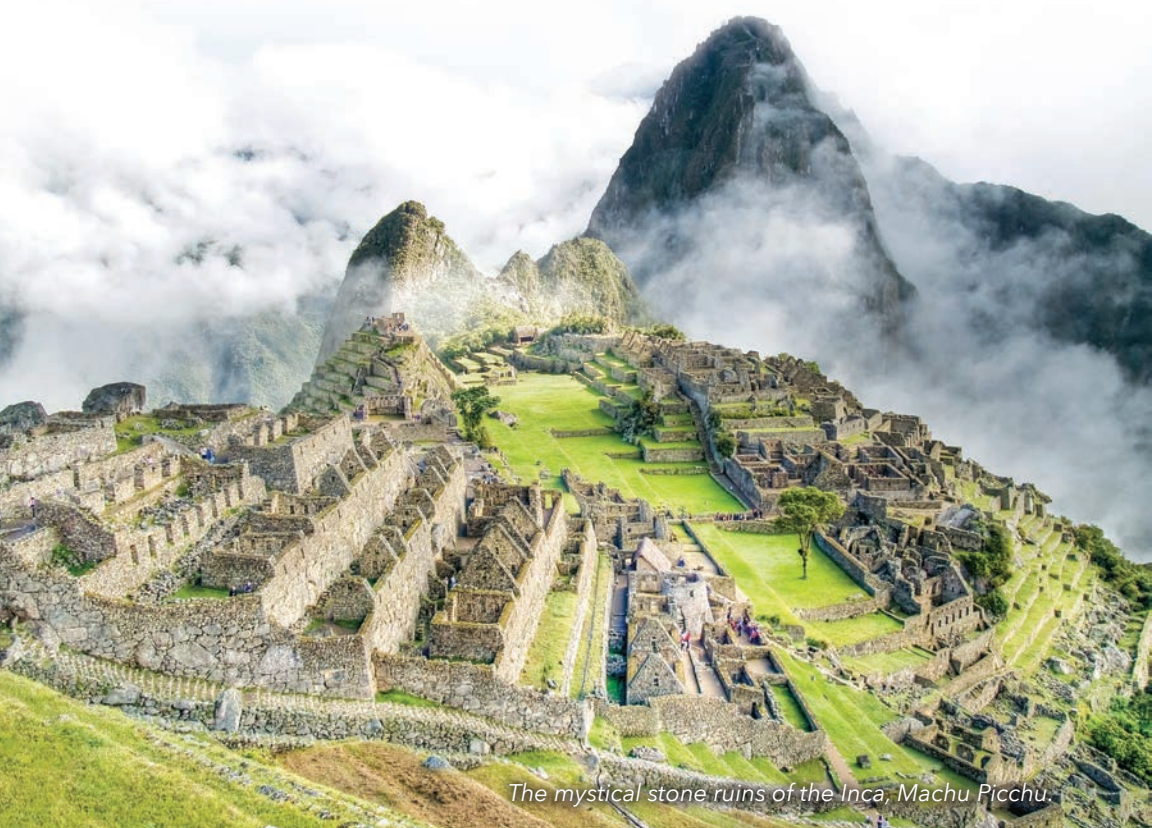
The mystical stone ruins of the Inca, Machu Picchu.

16 DAYS/15 NIGHTS—ABOARD NATIONAL GEOGRAPHIC ENDEAVOUR II + LAND EXCURSION