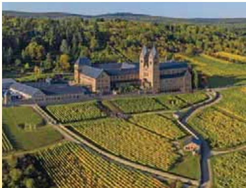
Abbey of St. Hildegard

This morning, the ship arrives in Strasbourg, capital of the French region of Alsace.