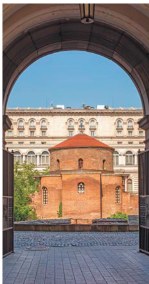
St. George Rotunda, Sofia