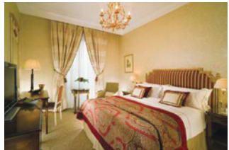
Sofia Hotel Balkan | Sofia, Bulgaria