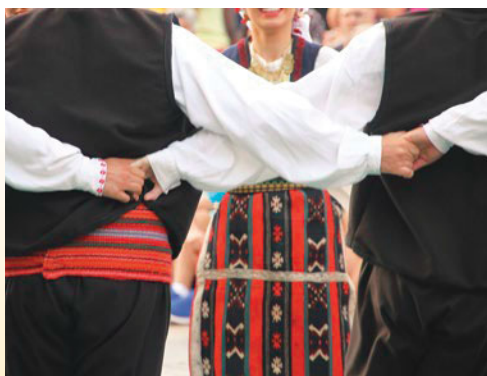
Serbian folk dancing