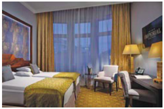
Art Deco Imperial Hotel | Prague, Czech Republic