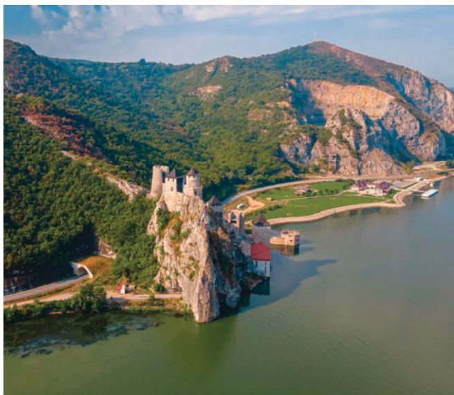
Banks of the Danube River, Serbia