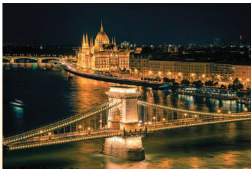
Budapest at night