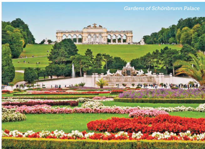
Gardens of Schönbrunn Palace