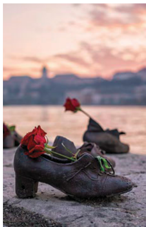
Shoes on the Danube Bank, Budapest

Knowledgeable Lecturers deepen your appreciation for the region and its history, culture and current events.