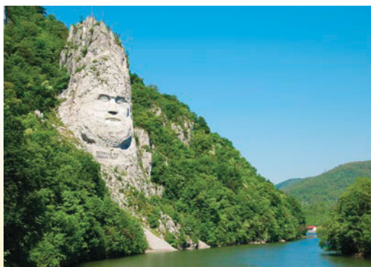
Decebalus stone sculpture, Iron Gate Gorge

Picturesque Passau. See Niedernburg Abbey, the medieval Veste Oberhaus, St. Stephen's Cathedral and other celebrated sites.