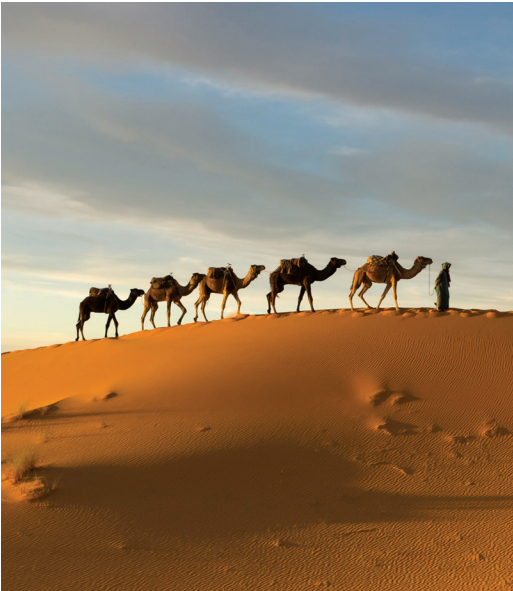
We ride camels in the Sahara on Day 8.

largest and most cosmopolitan city. After a brief orientation tour of the city, we visit the magnificent Hassan II Mosque, Morocco’s only functioning mosque open to non-Muslims. Tonight we celebrate our Moroccan adventure at a farewell dinner at a local restaurant. B,D