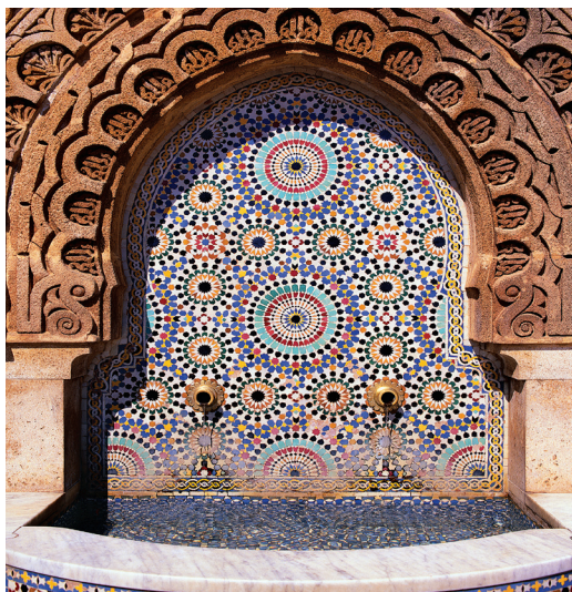
Traditional Moroccan tile work

En route to Marrakech today, we stop first at uninhabited Ait ben-Haddou, a UNESCO World Heritage site and one of southern Morocco’s most scenic villages that is often used as a location for fashion and film shoots. Its old section consists of deep red kashabs packed together so tightly they appear to be a single unit. Then, as we begin our descent from the High Atlas, we pass through typical villages with fortified walls and stone houses with earthen roofs. In Tizi N’Tichka, we traverse the Pass of the Pastures