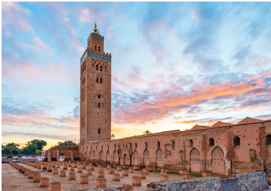
We see the distinctive Koutoubia Mosque – Marrakech’s largest – on Day 12.

Day 6: Fez We begin today with a visit to the Al-Attarine Madrasa, whose highlight is a small courtyard showcasing intricately detailed tilework and carving decorations dating to the early 1300s. We then continue our discovery on a walking tour of the medina , focusing on the artisans’ quarters, the 14 th -century Koranic schools, and Al Karaouine, the medieval theological university. The remainder of the afternoon is free for independent exploration and lunch on our own. Tonight, we enjoy a private dinner at an intimate family-run riad in Fez. B,L,D