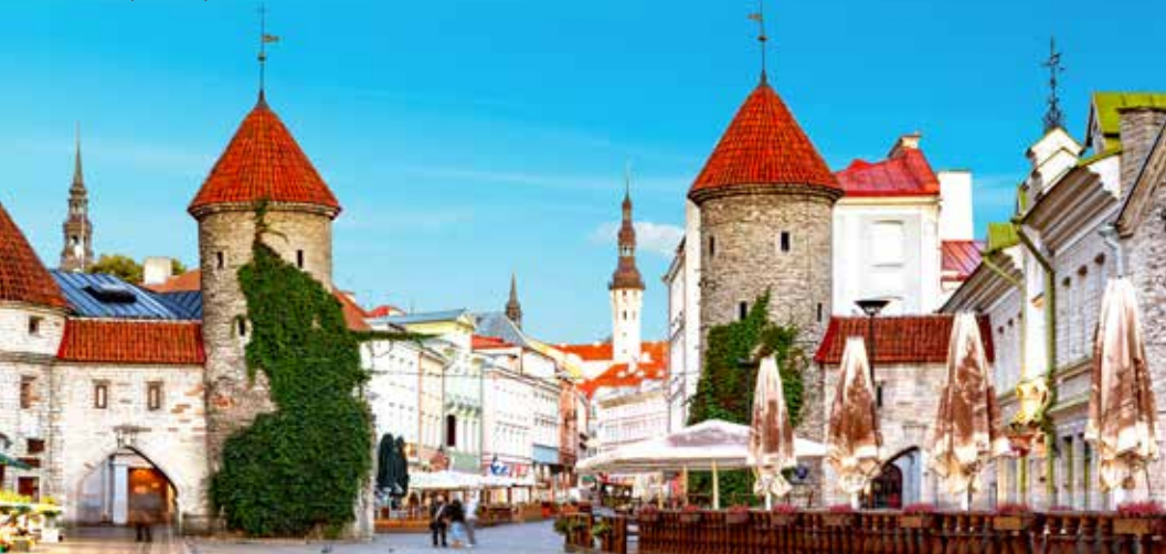
Old Town, Tallinn, Estonia

In his oft-quoted poem, "The Road Not Taken," Robert Frost awakened the idea and determination in many to choose the road less traveled; to overcome fear and avoid regrets. It sparked the quest for adventure in those wishing to experience more from life. Intrepid world travelers manifest this idea by seeking out destinations less traveled, such as Scandinavia and the Baltic Sea, in Northern Europe. Here, travelers have the rare opportunity to visit seven countries and experience a kaleidoscope of cultures in a short period of time, while cruising by ship from port to port. Ancient architecture, centuries-old history, storied landmarks, fascinating cities, and breathtaking, romantic scenery provide the perfect backdrop and opportunity to take the road less traveled, which will surely make all the difference.