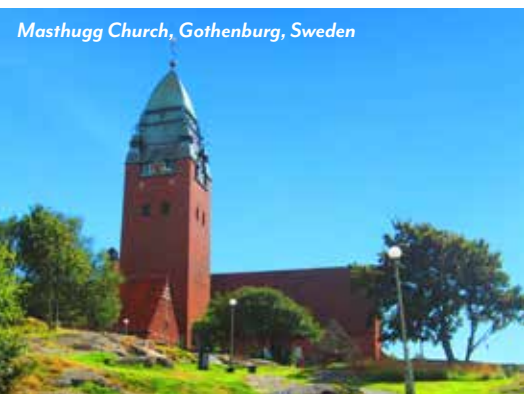
Masthugg Church, Gothenburg, Sweden

Following breakfast, disembark and transfer to Stockholm Arlanda Airport for your return flight home. (B)