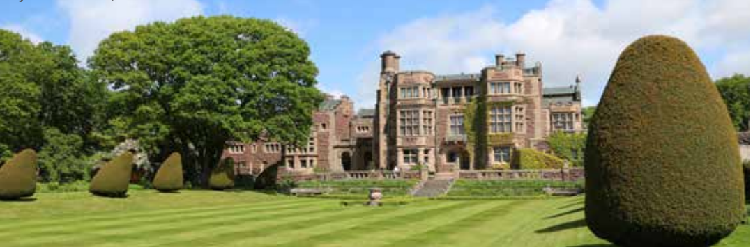
Tjölöholm Castle, Sweden

Klaipėda is a port city with a strong seafaring identity. The old town features German-style, 18th-century wood-framed buildings, winding cobblestone lanes and red-brick warehouses. Unusual statues are a delight to discover throughout the town. Today, choose your included excursion: visit nearby Palanga with its Amber Museum, or venture to the UNESCO-listed Curonian Spit. (B,L,D)