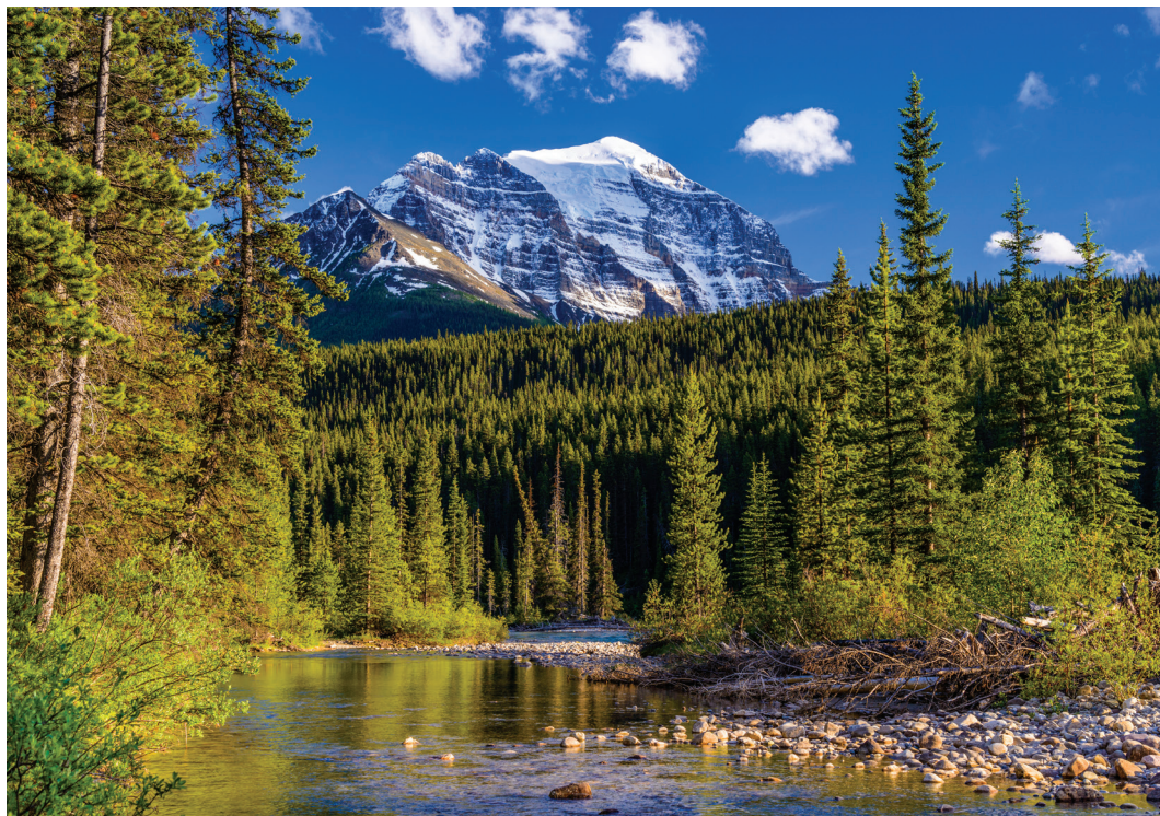
Five national parks sit within the Canadian Rockies.

a winding mountain pass that offers breathtaking views and hair-raising turns. After time for lunch on our own we meet up with our motorcoach and continue southwest across the Continental Divide. After arriving late this afternoon in the resort town of Whitefish, Montana, we dine together tonight. B,D