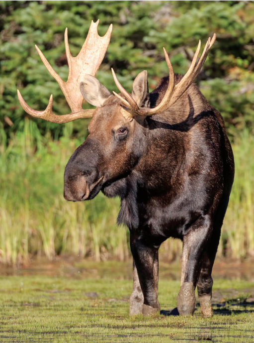
Moose abound in the Rockies.

Day 10: Banff Our last full day in the Canadian Rockies begins with a ride aboard the Banff Gondola to the top of Sulphur Mountain, so named for the hot springs on its lower flank. This 8,000-foot peak overlooking the town of Banff affords stunning mountain views in every direction; indeed, we can see six mountain ranges during this excursion. Then we travel Tunnel Mountain Road to visit two more natural wonders: the Hoodoos, a collection of eroded