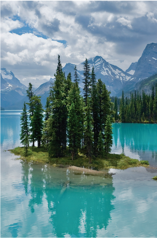
Spirit Island sits in stunning Maligne Lake.

limestone spires strung along a wooded hillside; and Bow Falls, a wide waterfall just outside Banff. The afternoon is free to explore Banff before we celebrate our outdoor adventures with a farewell dinner at our hotel. B,D