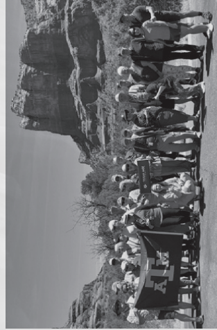
Texas A&M alumni on Orbridge's Southwest National Parks 2022 travel program.

PRRT STD U.S. POSTAGE PAID PERMIT NO. 825 SAN DIEGO, CA