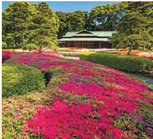
Japanese gardens at the Imperial Palace, Tokyo