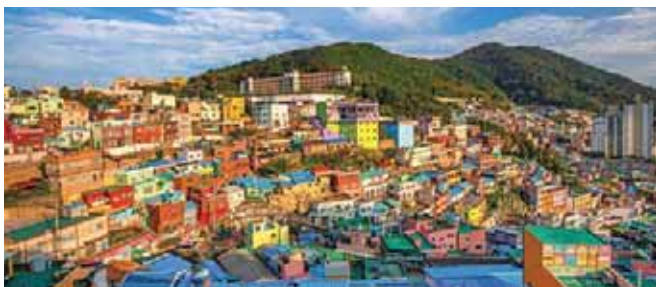
Colorful Gamcheon Culture Village, Busan