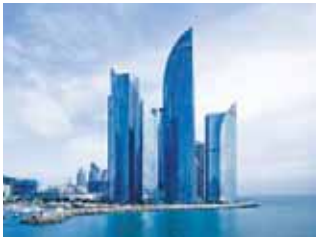
Park Hyatt Busan | South Korea