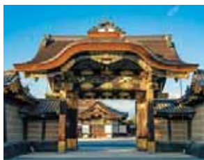
Nijō Castle, Kyoto