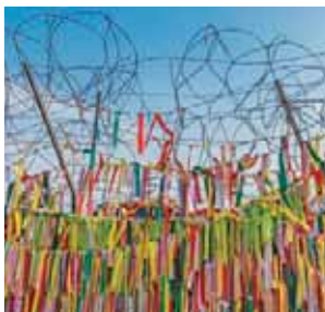
Prayer ribbons, DMZ

Knowledgeable Lecturers deepen your appreciation for the region and its history, culture and current events.