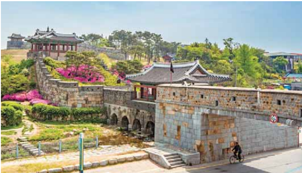
Hwaseong Fortress, Seoul

Depart your gateway city for Seoul, South Korea. 🌐 Cross the International Date Line.