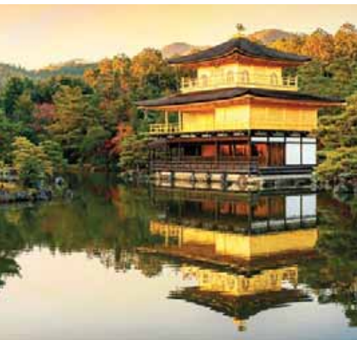
Left: The golden Kinkaku-ji Temple, Kyoto Below: Take in spectacular views of Tokyo from the observation deck of the Tokyo Skytree.