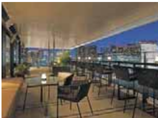
Mesm Tokyo, Autograph Collection | Japan