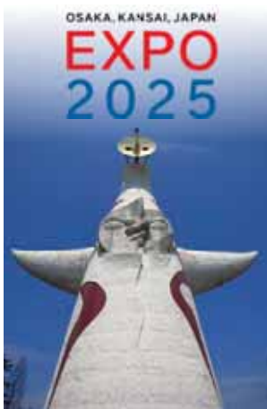
World Expo Commemorative Park