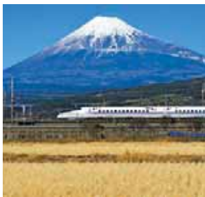
Catch a glimpse of Mt. Fuji aboard the shinkansen, a high-speed bullet train