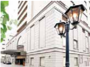
Hotel Nikko Princess Kyoto | Japan