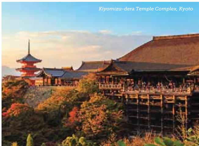
Kiyomizu-dera Temple Complex, Kyoto