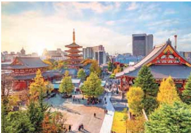
Senso-ji Temple, Tokyo