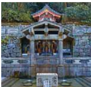
Otowa Waterfall, Kyoto