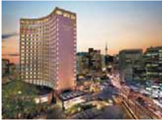
The Westin Josun Seoul | South Korea