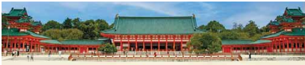
Heian-jingu Shrine, Kyoto