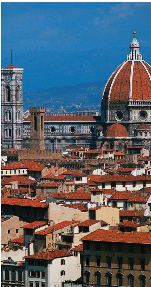
We visit splendid Florence on Day 12.