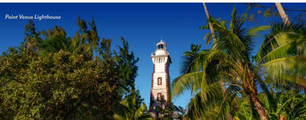
Point Venus Lighthouse

Spend time at leisure on this low-key island or choose an optional excursion to discover the traditional use of local plants