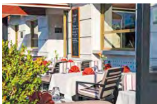
Hotel Aston La Scala | Nice