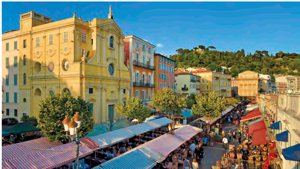
Cours Saleya, Nice