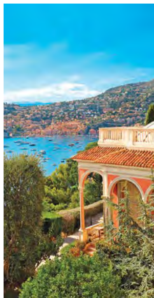
View of the Côte d'Azur from Villa Ephrussi

Knowledgeable Lecturers deepen your appreciation for the region and its history, culture and current events.