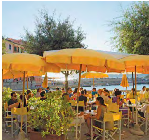
Seaside dining in Vernazza