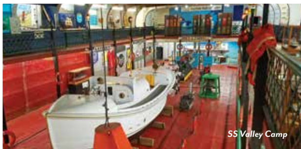
SS Valley Camp