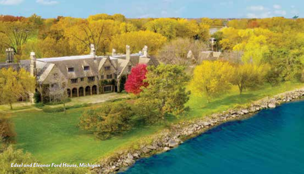
Edsel and Eleanor Ford House, Michigan