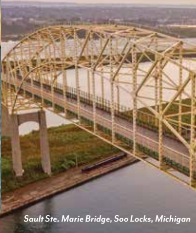
Sault Ste. Marie Bridge, Soo Locks, Michigan

In the heart of North America lies the world's largest reservoir of fresh water, carved by glaciers 10,000 years ago. Surrounded by 11,000 miles of spectacularly sculpted shoreline, the five Great Lakes boast powerful natural wonders, historical maritime landmarks and some of the greatest engineering feats of the 19th century. Our tour offers a glimpse of life on the Great Lakes over the last two centuries as we