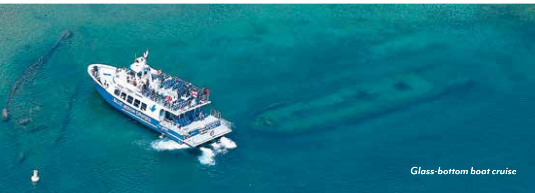
Glass-bottom boat cruise

Following breakfast, disembark and transfer to the airport for your return flight home. (B)