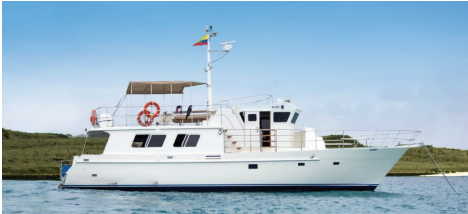
We stay in comfort for four nights in spacious rooms at the Royal Palm Hotel, set in the lush highlands of Santa Cruz island, and enjoy day cruises aboard the Santa Fe, our privately chartered yacht.