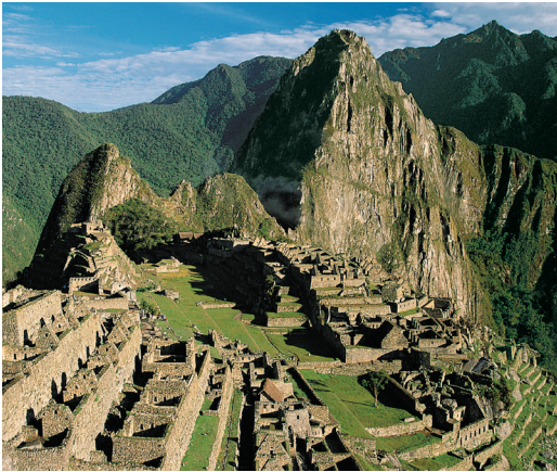
We explore the ruins at Machu Picchu on Days 5 & 6.

Day 15: Quito/Depart for U.S. This morning we visit Quito’s Botanical Gardens, featuring an orchidarium with more than 1,200 species of orchids; and