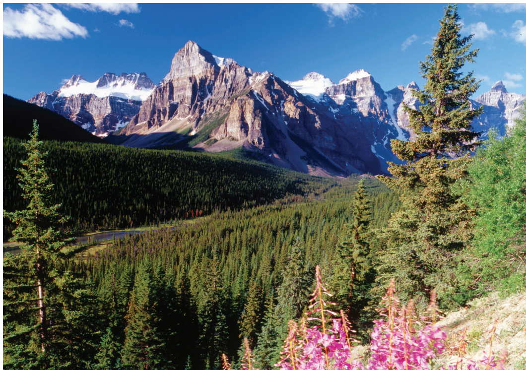
Five national parks sit within the Canadian Rockies.

a winding mountain pass that offers breathtaking views and hair-raising turns. After time for lunch on our own we meet up with our motorcoach and continue southwest across the Continental Divide. After arriving late this afternoon in the resort town of Whitefish, Montana, we dine together tonight. B,D