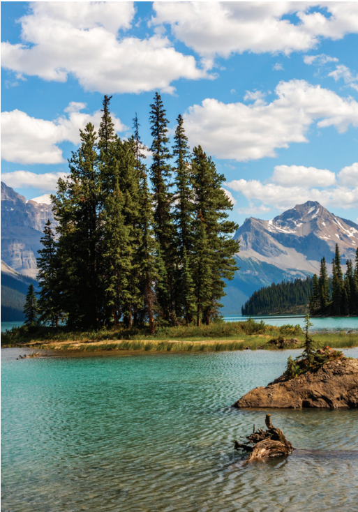
Maligne Lake and Spirit Island, Jasper National Park

Prices include int'l airfare and all taxes, surcharges, and fees.