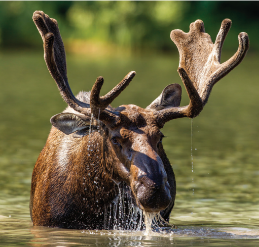
A bull moose enjoys a dip.

Day 11: Banff/Depart for U.S. We transfer this morning to the Calgary airport for our flights home. B