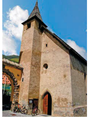
Old church, Zuoz