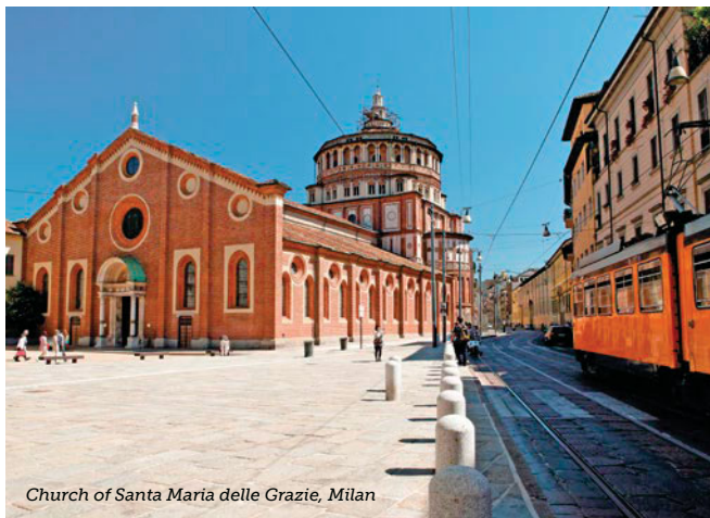
Church of Santa Maria delle Grazie, Milan