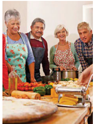
Piedmontese cooking class