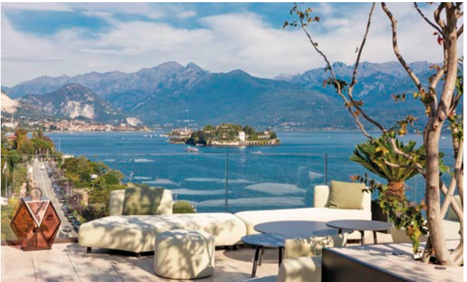
Hotel la Palma | Stresa