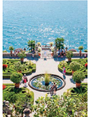
Isola Bella, Lake Maggiore