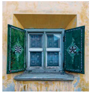
Charming Engadine architecture