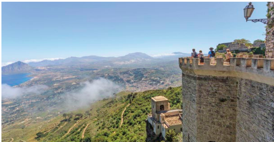
Spectacular view from castle balcony, Erice