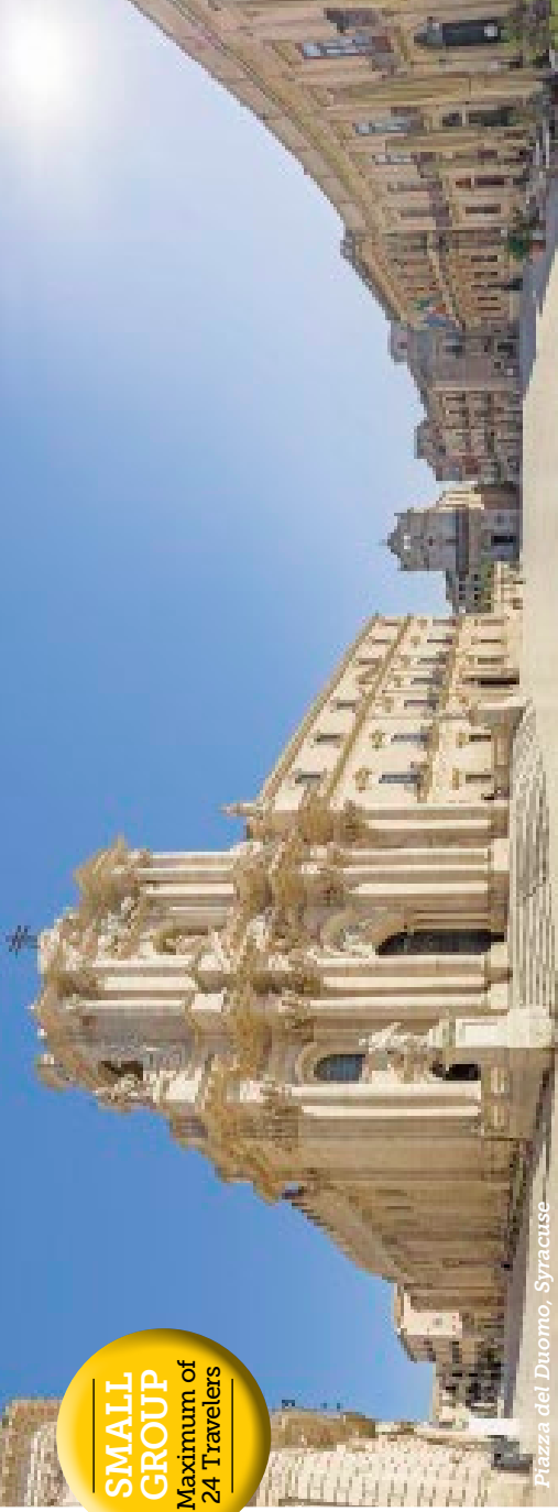
Piazza del Duomo, Syracuse