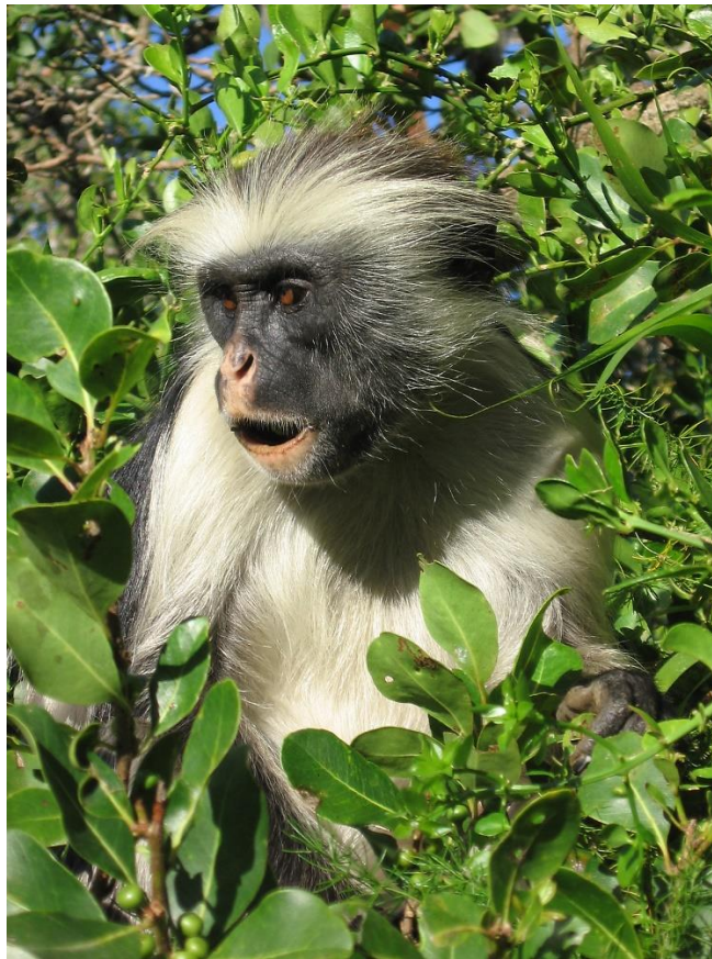
Red Colobus Monkey / Safari Legacy