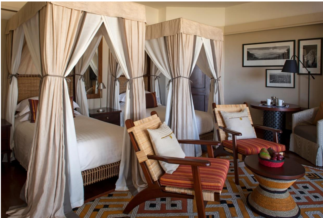
Four Seasons Serengeti Safari Lodge

Itinerary and accommodations are subject to change.