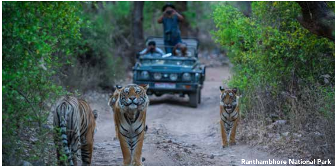
Ranthambhore National Park