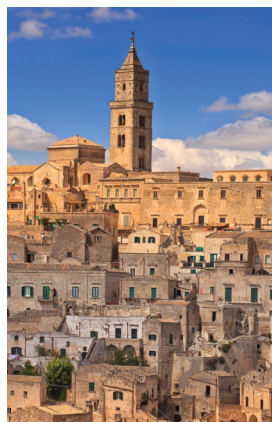
We spend two nights in ancient Matera.

Day 14: Sorrento/Amalfi Coast We embark this morning on a breathtaking drive along the winding, cliff-top Amalfi Coast road. This stretch of terraced