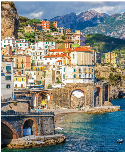
Stunning Amalfi Coast