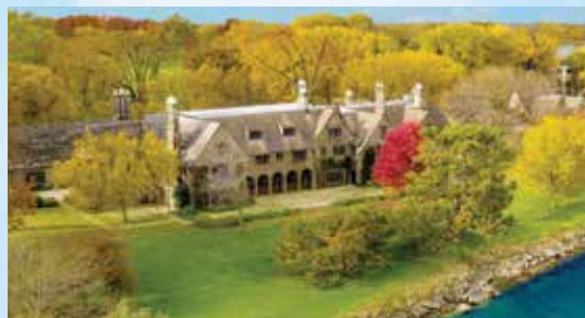
Delight in Edsel Ford's authentically rendered magnificent Cotswold-style mansion.

Chart Detroit's rise to the apex of American idealism. Visit the Detroit Institute of Arts, one of the nation's most significant collections of art, housed in a magnificent Beaux Arts building. See Diego Rivera's monumental Detroit Industry mural which captures the city's blue collar history, as well as masterworks by Auguste Rodin, Michelangelo Merisi da Caravaggio, Vincent Van Gogh, Edgar Degas and Paul Cézanne. Discover the rich architectural legacy of the Gilded Age at Grosse Pointe where grandiose mansions, replete with lavish period furnishings, reflect Detroit's commitment to architectural preservation. Tour the Edsel and Eleanor Ford Mansion, a polished window on the grandeur of America's industrial aristocracy. The manor was designed by Detroit's preeminent architect, Albert Kahn, to resemble Cotswold