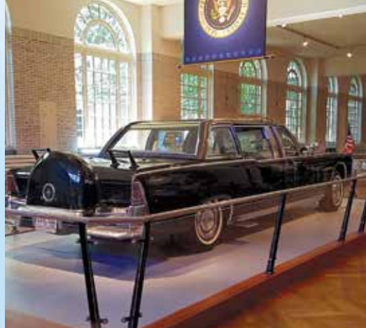
See the limousine originally used by President Kennedy, leased by Ford to the Secret Service for $500 a year.