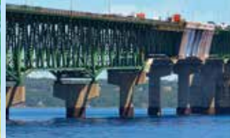
Be on deck to witness the engineering of the longest suspension bridge, as the ship

Horseshoe Falls and experience firsthand the sheer force of this geological wonder.