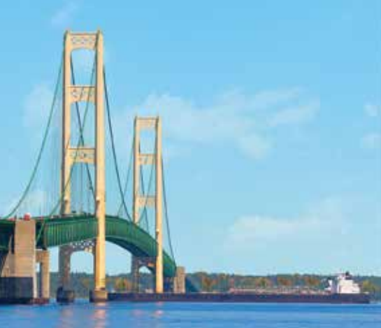
“miracle” of Mackinac Bridge, the Western Hemisphere’s longest suspension bridge, spans the water and carries ships and trucks beneath.