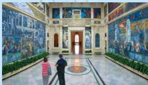
Admire Diego Rivera’s iconic Detroit Industry murals, inspired by months of research at Ford’s Rouge River plant.

boat cruise from Little Tub Harbor to Big Tub Harbor, which preserves almost two dozen 19 th -century shipwrecks. See the remains of the schooner Sweepstakes , submerged in only 20 feet of water with its hull almost completely intact. Observe photogenic Big Tub Lighthouse which has been guiding ships since 1885, and the charm of Flowerpot Island, famous for its natural “flowerpot” rock pillars, sea stacks and wave-carved caverns.