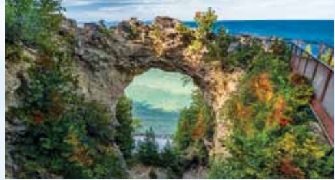
Discover the natural limestone of Arch Rock, rising 146 feet over Mackinac Island.

Photo this page: The landmark GRAND HOTEL opened in 1887 as a summer retreat for vacationers who came to Mackinac Island via steamer and boat.