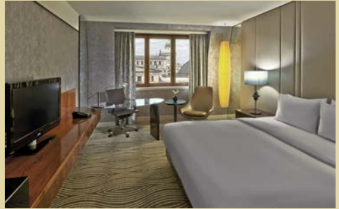
Hilton Berlin | Berlin