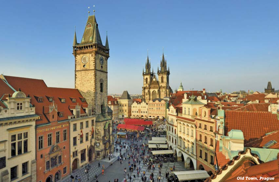
Old Town, Prague