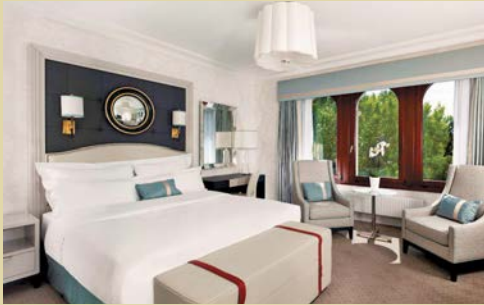
Hotel Bristol | Warsaw