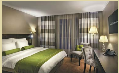
Cosmopolitan Hotel Prague | Prague