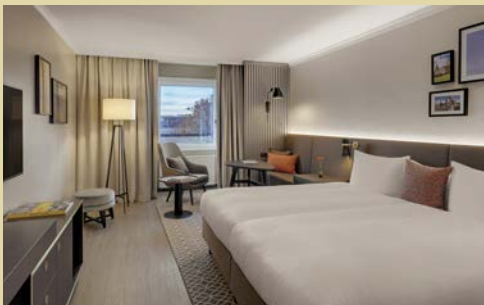
Bilderberg Bellevue Hotel Dresden | Dresden