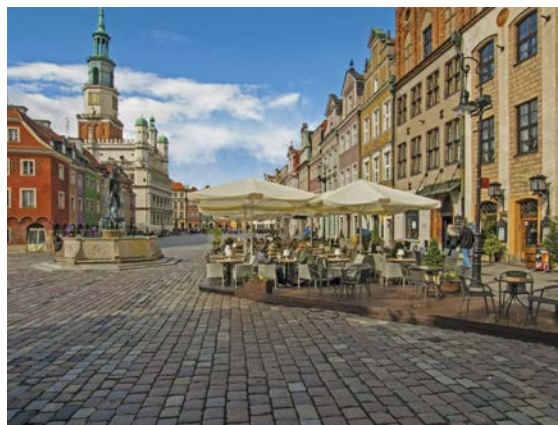
Old Town, Poznań