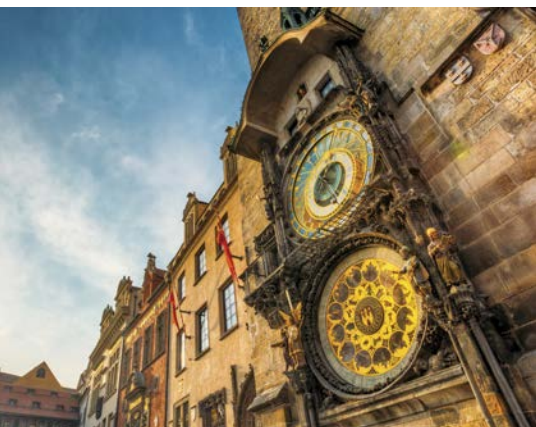
Astronomical clock, Prague