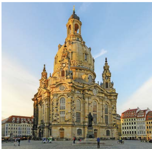
Church of Our Lady, Dresden

Enrichment: Velvet Revolution. Discover how this pivotal movement in 1989 freed the former Czechoslovakia from communist control.