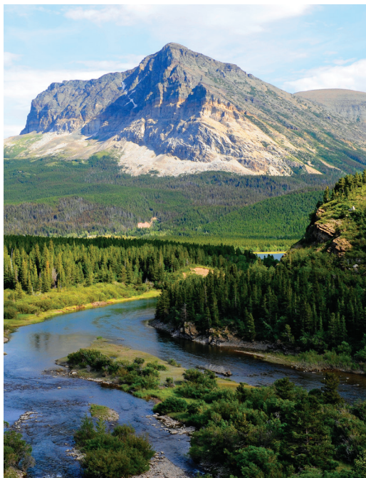
A magnificent vista in Glacier National Park