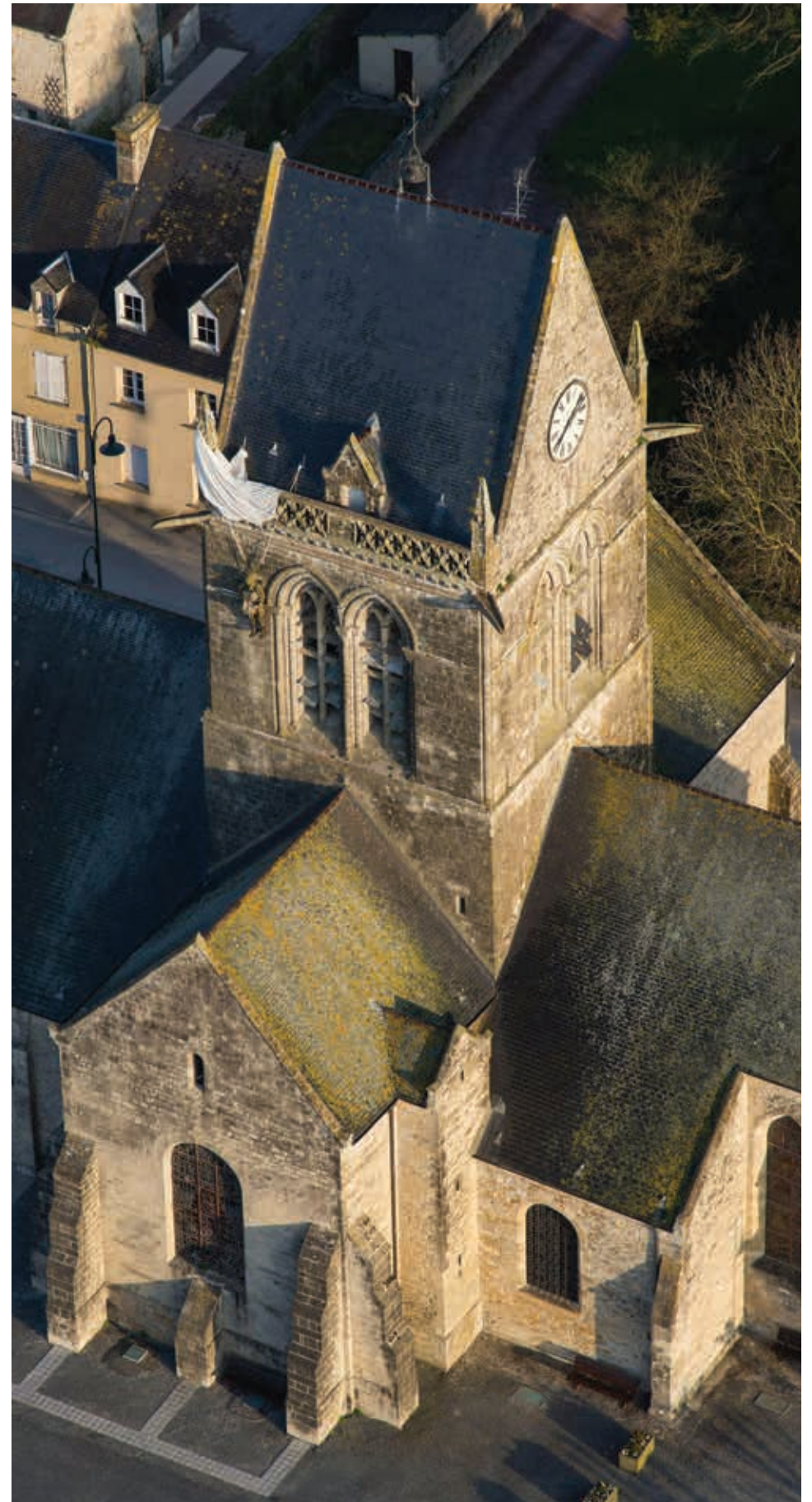
Photo page 10: General Eisenhower talks with paratroopers of the 101st U.S. Airborne before D-Day. Photo page 11: Aerial view of Sainte-Mère-Église