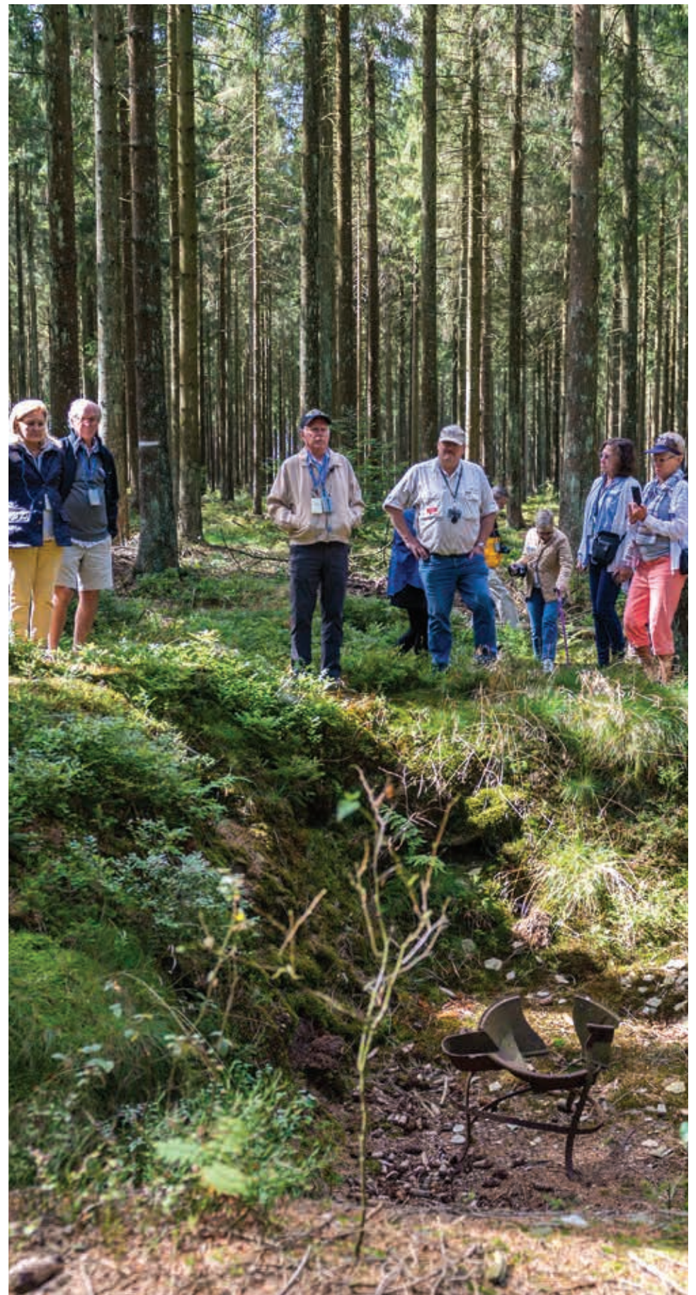
Photo Page 22: A snow-suited US infantry soldier is shown in St-Vith, Belgium, January 1945. Photo page 23: “Hasselpath” located near Krinkelt-Rocherath, foxholes where American GIs held the line are still visible to travelers.