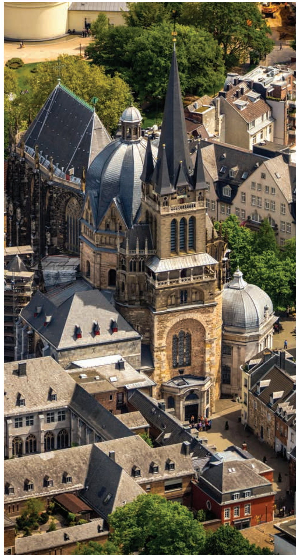
Photo Page 16: General Alfred Jodl (standing), Colonel Oxenius (left) and General Admiral Friedeburg (right) after the signing of the unconditional surrender of the German Armed Forces in the headquarters of General Eisenhower in Reims on May 7, 1945. Photo page 17: Aerial view of Aachen Cathedral.