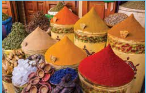
Breathe in the fragrant aromas of Moroccan spices, sold at marketplaces and presented in a signature style.

Built at the interchange of the Sahara Desert and the Atlas and Anti-Atlas Mountains, Marrakech blossomed into