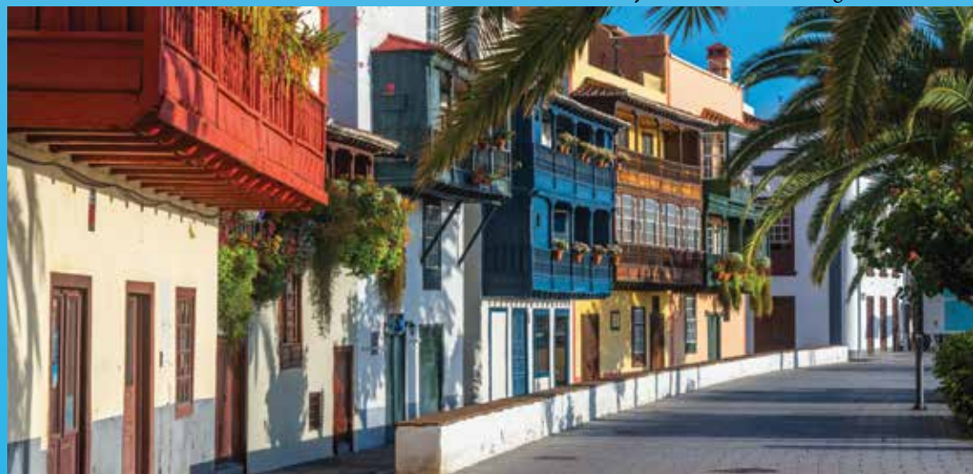
The 15 th -century city of Santa Cruz de La Palma was the historical epicenter of trade between Spain and the American colonies. Stroll down its cobblestone streets and admire colonial-style houses with charming balconies.

Visit the Medersa Bou Inania, walk past the spectacular fountain at Nejjarine Place and see the Kairouyine Mosque. Discover the history of Seffarine Place and see its 16 th -century marble fountain, decorated with fleur-de-lys. Glimpse the famed tanneries of Fez—clusters of stone vats filled with red, yellow and brown dyes, and skins hanging to dry in the sun.