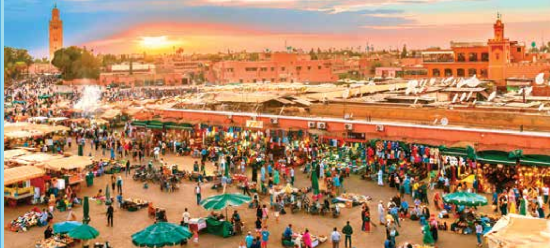
Marrakech's famous Jemaa El Fna Square is a bustling marketplace filled with a variety of vendors, ironmongers and barbers by day and storytellers, snake charmers and other entertainers by night.

the hub of the great Berber Empire. Visit masterpieces of Moorish architecture, including the exquisite Bahia Palace, glorious Menara Gardens and 12 th -century Koutoubia Mosque.