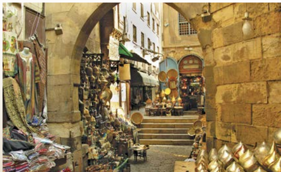
Khan el Khalili bazaar, Cairo

Discovery: Epigraphic Survey, Chicago House, Oriental Institute, The University