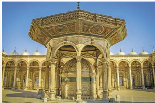
Mosque of Mohammed Ali, Cairo

Free Time: Explore the colorful Khan el Khalili bazaar on your own.