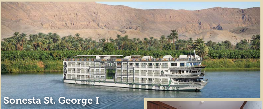
Sonesta St. George I

Cruise the Nile River in style aboard this elegant, upscale ship. Sample international cuisine from lavish buffets for breakfast and lunch and from à la carte menus for dinner. Stop by the Panoramic Lounge for refreshments and stellar river views. The ship also features a swimming pool, sun deck, spa and wellness center. Relax in your comfortable stateroom which includes French windows and a seating area. The en-suite spa bathrooms are fitted with a steam shower, Jacuzzi and water massage. Wi-Fi is available.