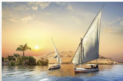
Feluccas sailing near Aswan