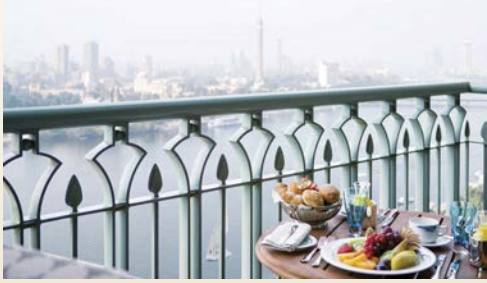
Four Seasons Hotel Cairo at Nile Plaza | Cairo