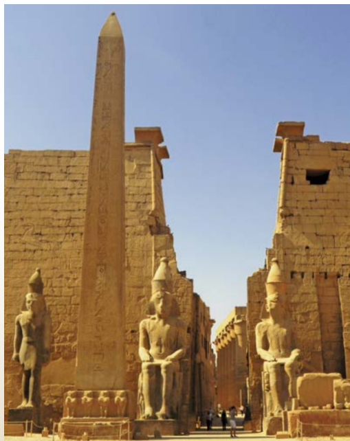
Temple of Luxor

Revel in the Nile scenery on your way to Edfu.