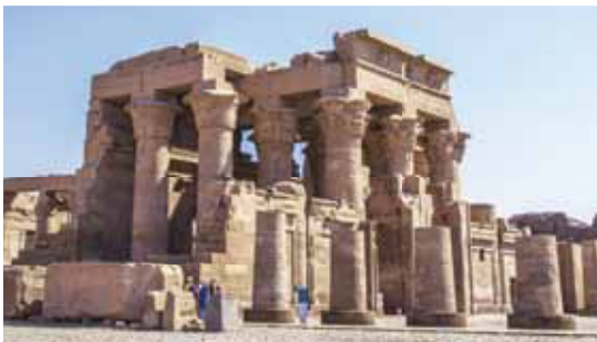
Temple of Sobek and Haroeris, Kom Ombo