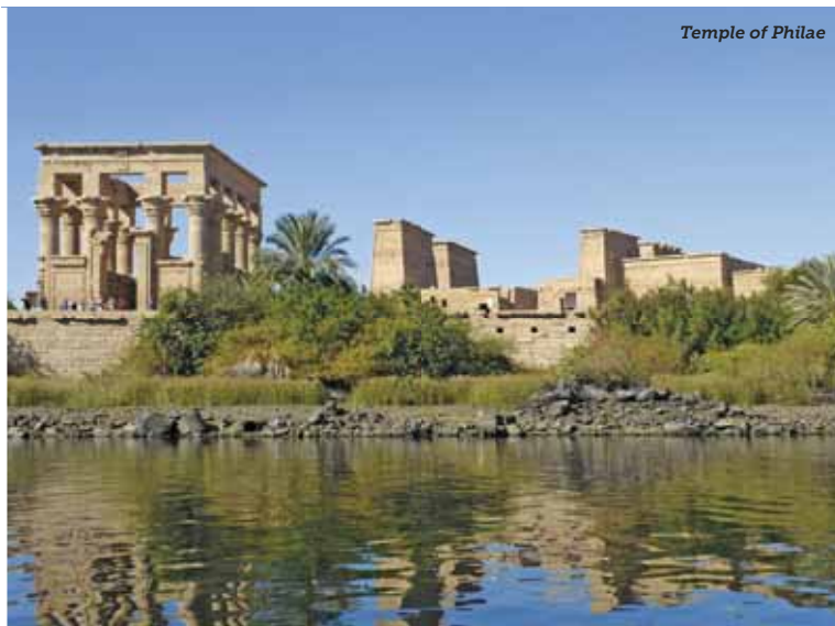
Temple of Philae