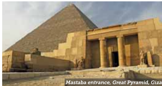
Mastaba entrance, Great Pyramid, Giza