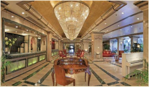
Sonesta St. George Hotel Luxor | Luxor