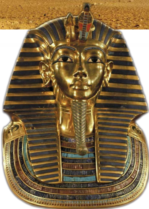
Top: Pyramids of Giza | Above: Burial mask of Tutankhamen

Discovery: Pyramids of Giza. Marvel at the last surviving monument of the Seven Wonders of the Ancient World, the Great Pyramid of Giza, built for the pharaoh Khufu out of 2.3 million massive stone blocks. See the mysterious Sphinx standing guard nearby, which stretches 240 feet in length.