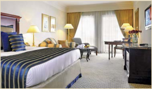
InterContinental Citystars Cairo | Cairo