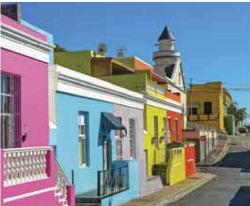
Colorful Bo-Kaap, Cape Town

Sheltered by Table Mountain, South Africa's Mother City is one of the world's most beautiful cities. Centuries-old Cape Dutch houses and colorful gardens dot the cityscape. A bustling waterfront welcomes visitors with inviting cafés and boutiques set amid workaday harbor life.