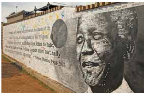
Nelson Mandela mural, Soweto

Note: Itinerary may change due to local conditions.