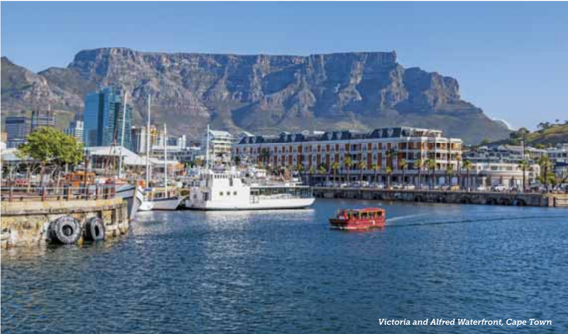
Victoria and Alfred Waterfront, Cape Town