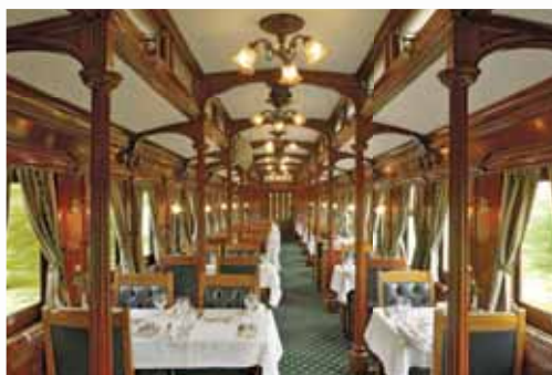
Chobe National Park