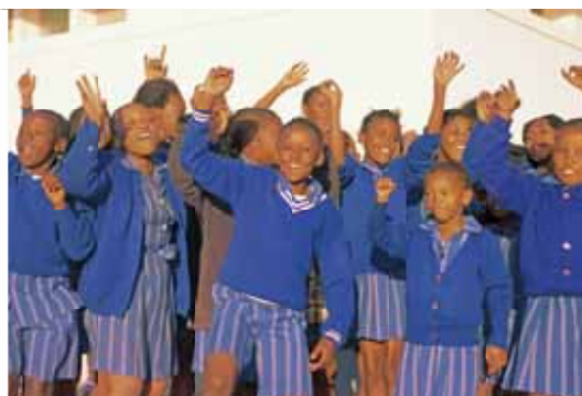
Soweto youth group