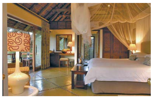
Thornybush Game Lodge | OOOOO Thornybush Nature Reserve

Our travel experts have selected these luxury properties for your comfort. The hotels' prime locations put the cities at your doorstep, and the game lodges sit in the heart of game-rich parks, allowing you to immerse yourself fully in the safari experience. Details in the design and décor celebrate the local culture and enhance the ambience of each hotel and lodge. Their restaurants feature menus of elegantly prepared local and international cuisine. Of utmost importance is the superior quality of the services, amenities and accommodations, allowing you to maximize the enjoyment of your stay.