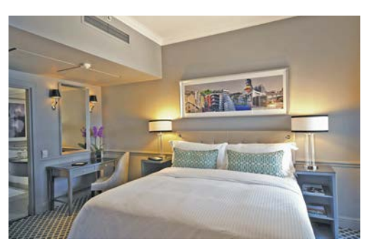
54 on Bath | Johannesburg 0000