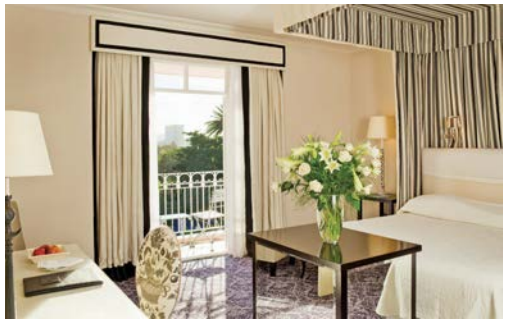
Belmond Mount Nelson Hotel | Cape Town