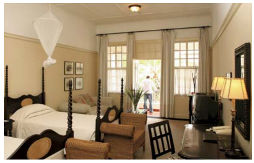
The Victoria Falls Hotel | OOOOC