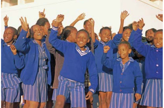
Soweto youth group