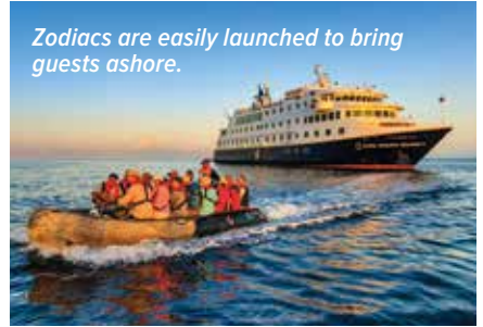
Zodiacs are easily launched to bring guests ashore.

observation deck and lavishly windowed throughout the public spaces, cabins, and suites, she ensures stunning views of the never-ending panorama and access to the natural world. Designed and equipped with the benefit of 50 years experience in Galápagos, she is the perfect platform for exploring these islands, with a fleet of onboard tools—snorkel gear for every guest, kayaks, and stand-up paddleboards for personal forays. National Geographic Endeavour II also carries a glass-bottom boat, granting everyone a window on the undersea, with a naturalist aboard to illuminate the vivid life there.