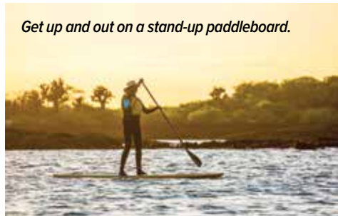
Get up and out on a stand-up paddleboard.

Galápagos offers, from swimming with sea lions off a pristine arc of beach, to snorkeling with a passing flotilla of Pacific green sea turtles. Make it yours.