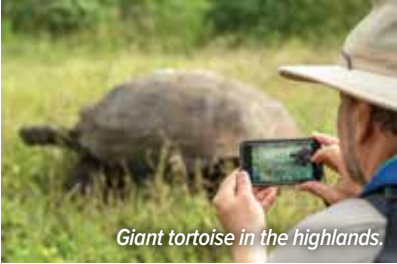
Giant tortoise in the highlands.

The power and relevance of our needs as humans to connect with nature cannot be underestimated. That connection is perhaps at its greatest level in Galápagos. The vast number of animals living in the Galápagos archipelago is a major reason you have chosen to travel to this remote