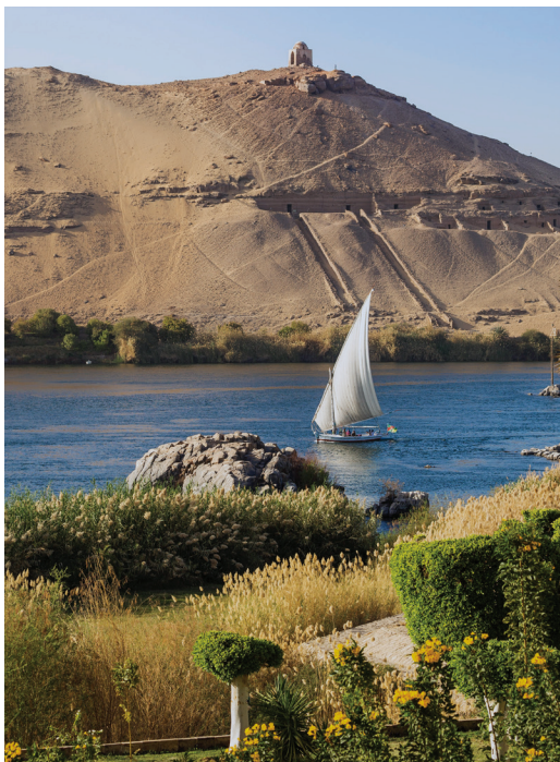
We sail traditional feluccas along the Nile.

Day 15: Depart for U.S. Very early this morning we transfer to the airport for our return flight to the U.S. B