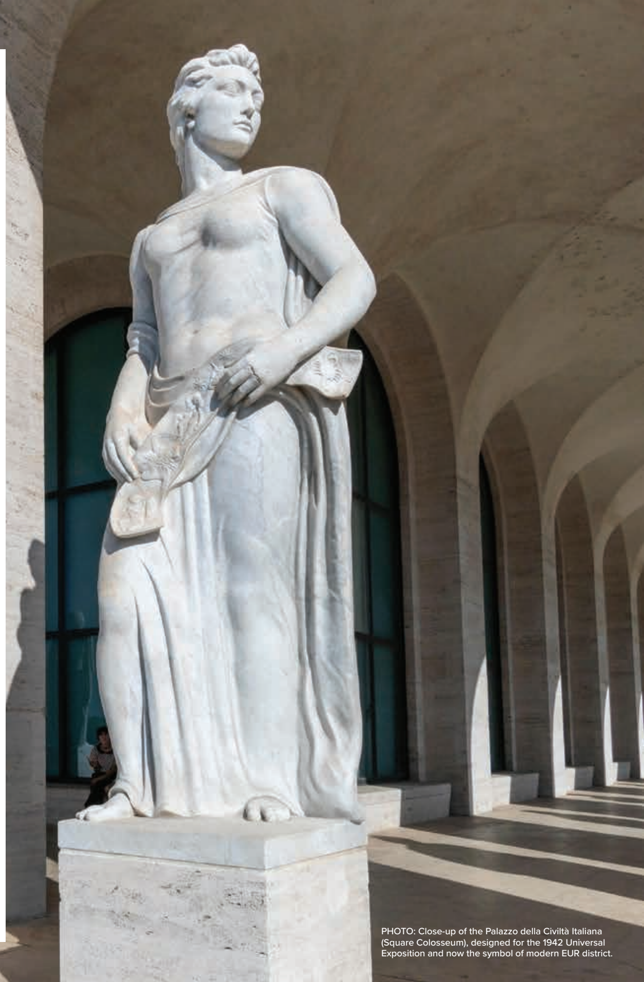
PHOTO: Close-up of the Palazzo della Civiltà Italiana (Square Colosseum), designed for the 1942 Universal Exposition and now the symbol of modern EUR district.