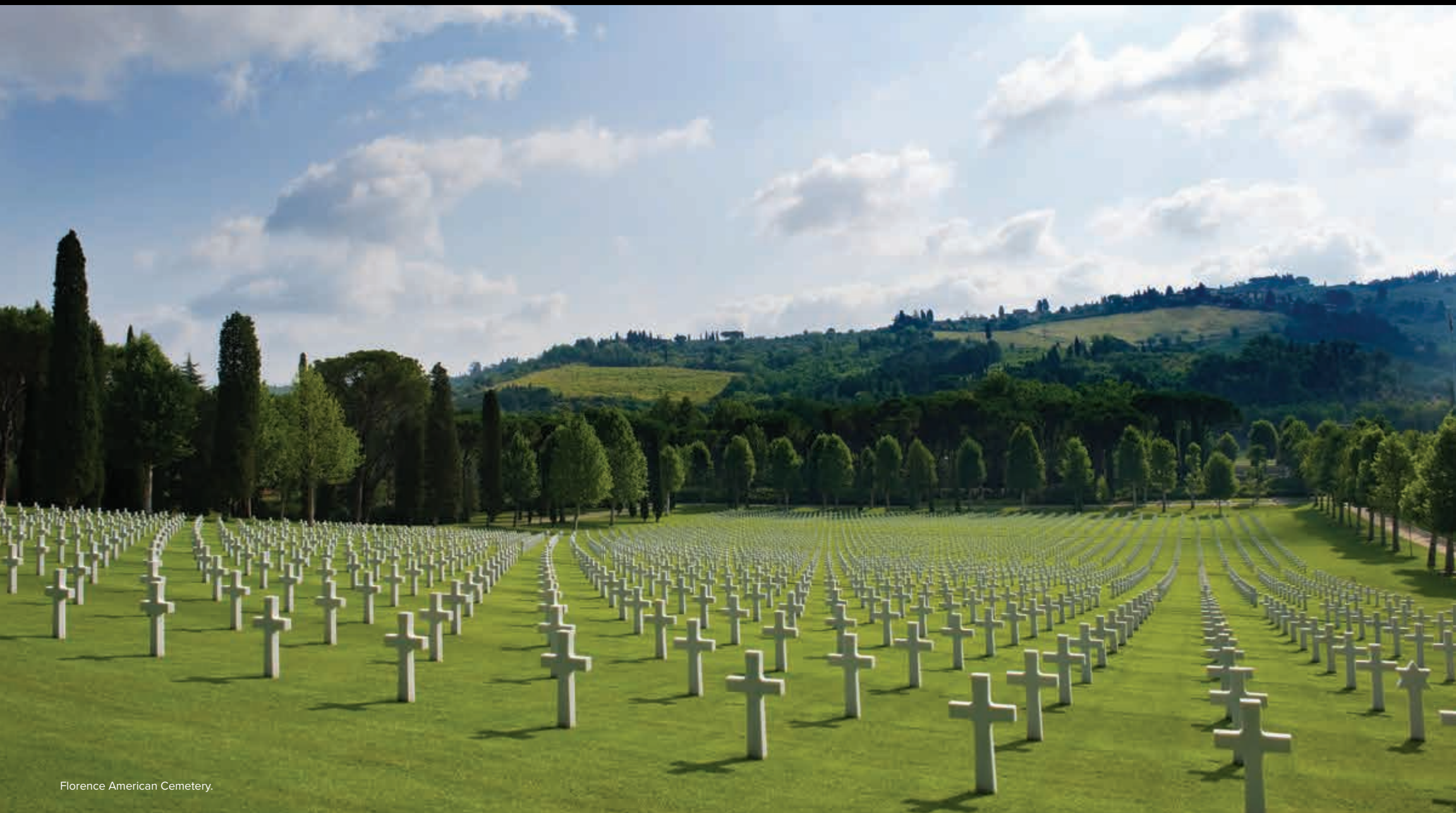
Florence American Cemetery.

Accommodations: Grand Hotel Baglioni, Florence (B, L)