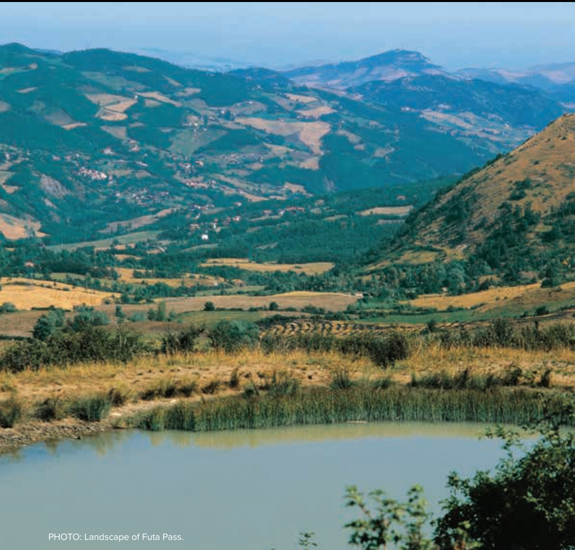
PHOTO: Landscape of Futa Pass.

Accommodations: Grand Hotel Baglioni, Florence (B, L, D)