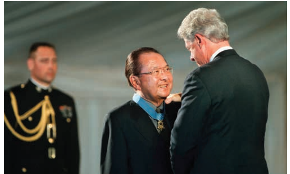
PHOTO: US President Bill Clinton congratulates US Senator Daniel Inouye of Hawaii, after awarding him the Congressional Medal of Honor on June 21, 2000, at the White House in Washington, DC, for his service in World War II.

PHOTO: First Lt. Daniel Inouye.