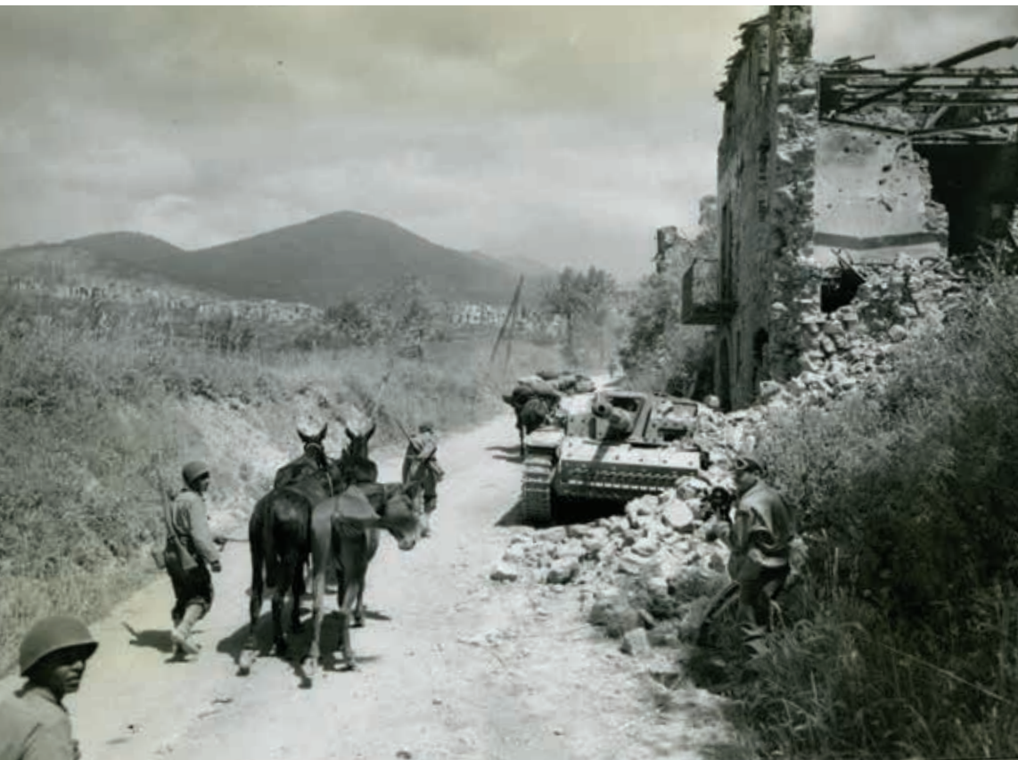
PHOTO: African American soldiers lead mules to the front in Italy and pass a wrecked German tank lying by the roadside. A Signal Corps member films them with a camera in the lower right corner, May 21, 1944.

Following the initial landings in the south, the Allies found themselves bogged down facing the formidable Gustav Line, a network of German defenses in the mountains between Naples and Rome. Attempting to outflank this line, the 36th and 45th Infantry Divisions achieved a successful amphibious landing in Anzio on January 25, 1944, but sluggish commanders failed to move rapidly enough, resulting in another stalemate. The destruction of Monte Cassino by the Allies in 1944 served mainly to generate headlines and fodder for German propaganda. The spring thaw in the mountains found the Allies once more on the advance, liberating Rome on June 4, 1944, creating brief headlines around the world that would soon be outshined by the June 6 landings in Normandy. Meanwhile, German Field Marshal Albert Kesselring retreated to the northern Apennines to establish yet another defensive position known to the Allies as the Gothic Line. General Mark Clark's Fifth Army faced a desperate enemy and unforgiving terrain, and it was here he coined the phrase that defined the Italian campaign: "Mud, Mountains, and Mules."