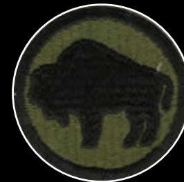
A 92nd Infantry Division Patch