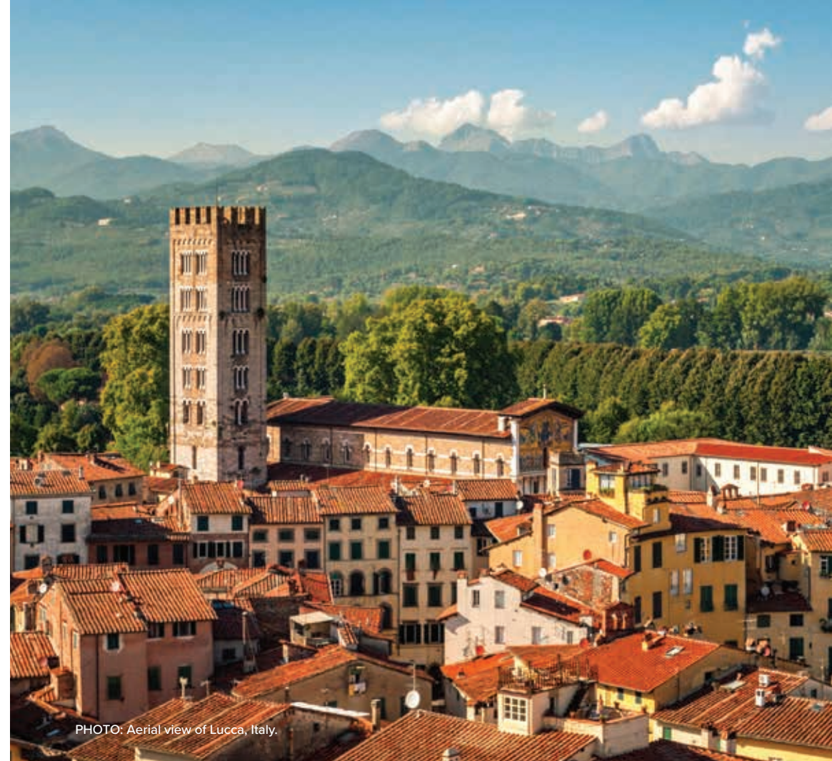
PHOTO: Aerial view of Lucca, Italy.