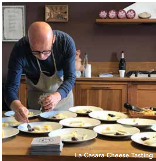
La Casara Cheese Tasting