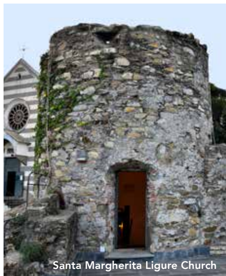
Santa Margherita Ligure Church