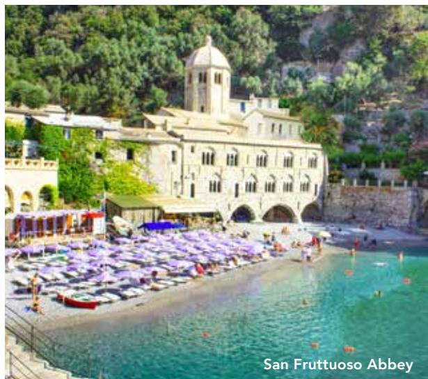
San Fruttuoso Abbey