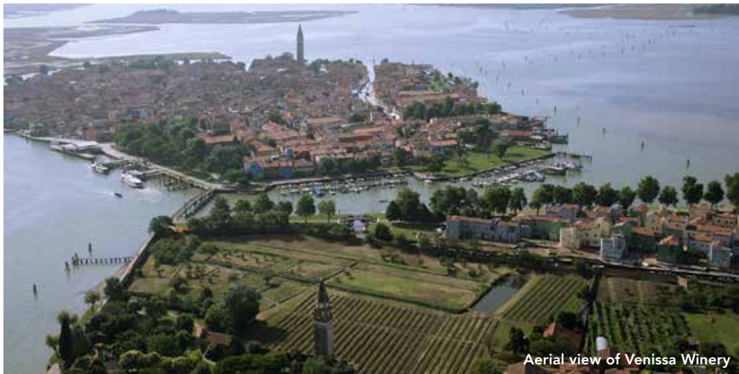
Aerial view of Venissa Winery