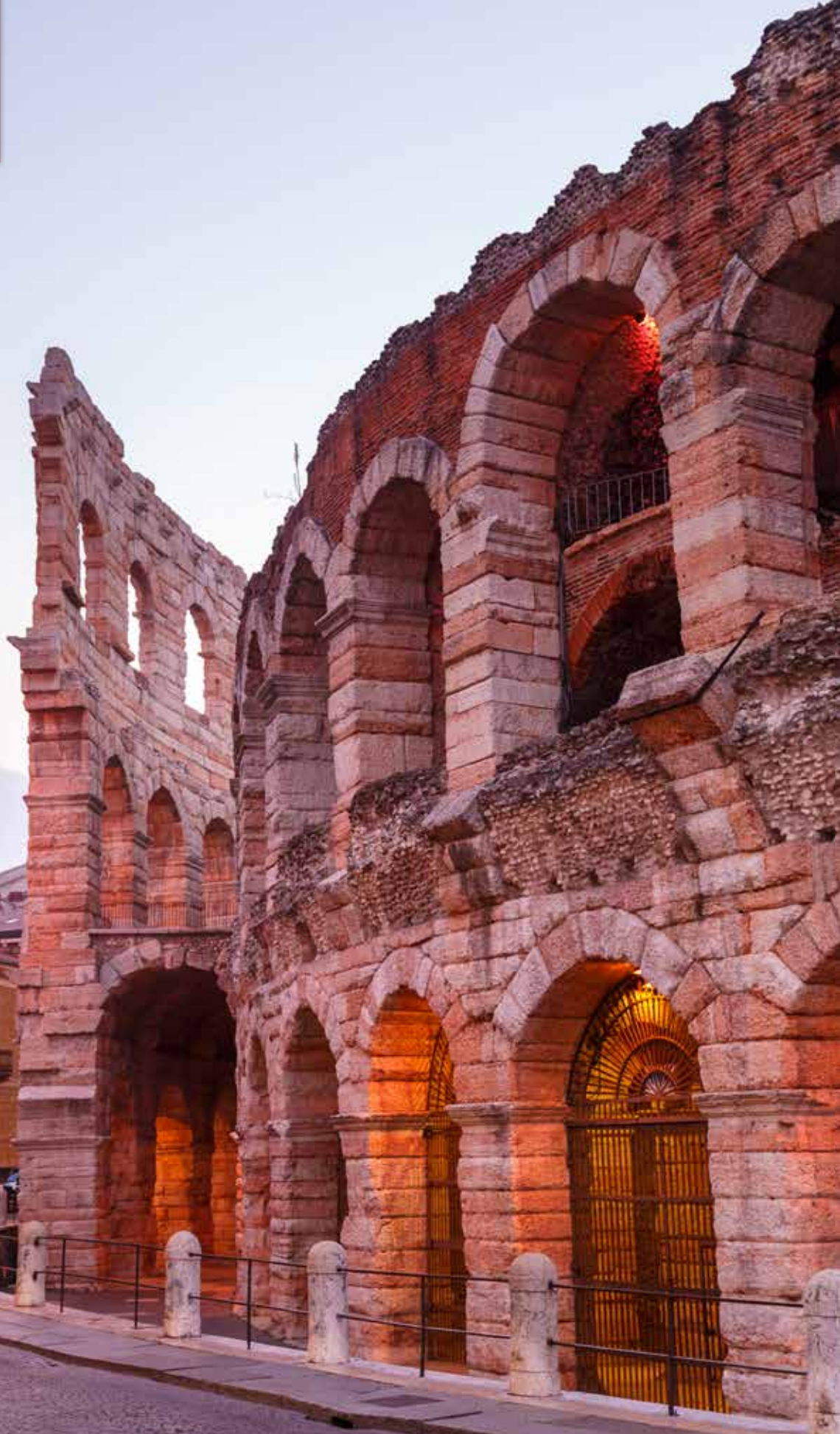
Colosseum Arena di Verona