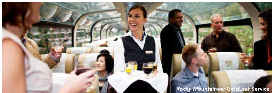
Rocky Mountaineer GoldLeaf Service

GoldLeaf Service: Bi-level dome car with full-length panoramic windows, reclining dome-level seats that rotate to accommodate groups of four, and exclusive meal service and dining room access on the first level with a full galley kitchen offering a gourmet menu with hot food.