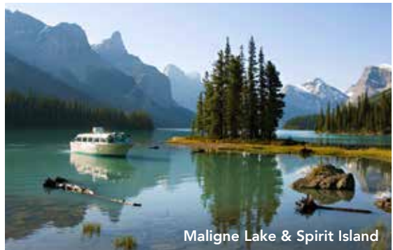
Maligne Lake & Spirit Island