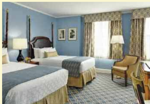
FRANCIS MARION HOTEL | CHARLESTON