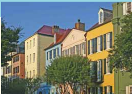
Rainbow Row, Charleston