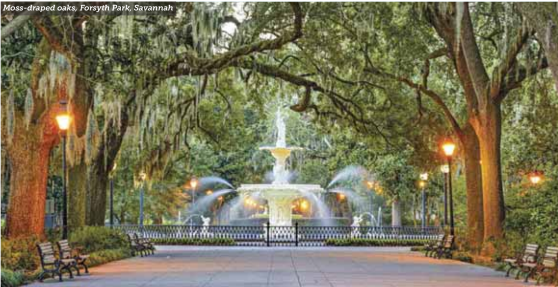
Moss-draped oaks, Forsyth Park, Savannah