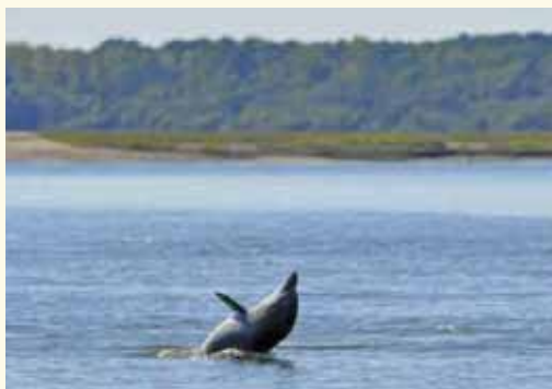
Dolphin, Hilton Head