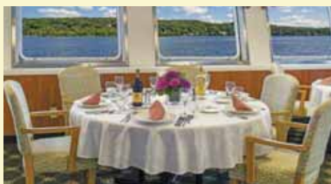
Preparation for dinner