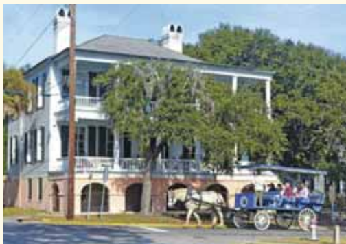
Carriage tour, Beaufort