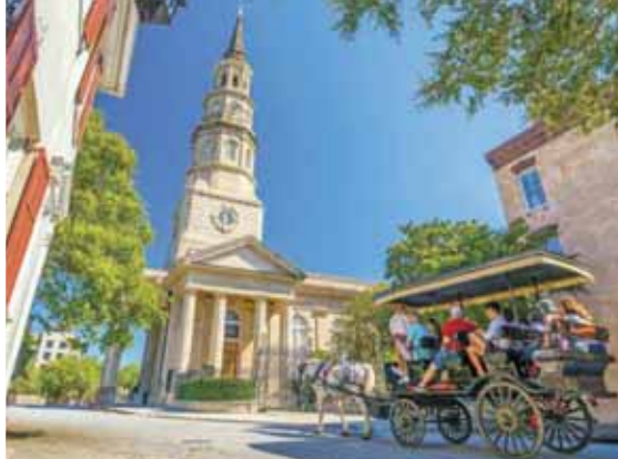
Carriage ride in Charleston