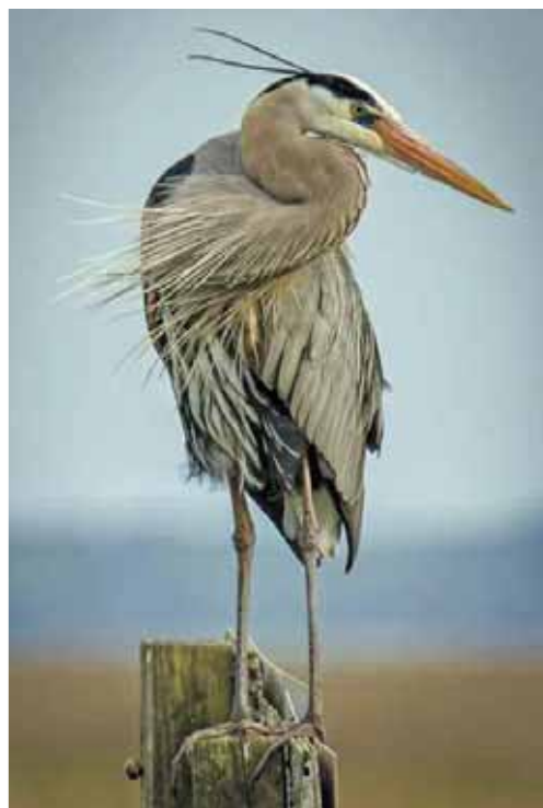
Above: Lighthouse, Hilton Head | Inset: Great blue heron

Kick off your shoes, unwind and feel the sand beneath your feet on this easy-going island retreat! Vacationers cherish the wide, pristine beaches and the bevy of championship golf courses (more than 30!). Its placid marshes, coastal waters and brilliant skies are also teeming with wildlife, including alligators, loggerhead sea turtles, dolphins, manatees, egrets, storks and great blue heron.