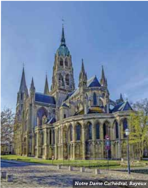
Notre Dame Cathedral, Bayeux

NOT INCLUDED -Fees for passports and, if applicable, visas, entry/departure fees; personal gratuities; laundry and dry cleaning; excursions, wines, liquors, mineral waters and meals not mentioned in this brochure under included features; travel insurance; all items of a strictly personal nature.