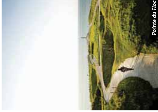
Pointe du Hoc