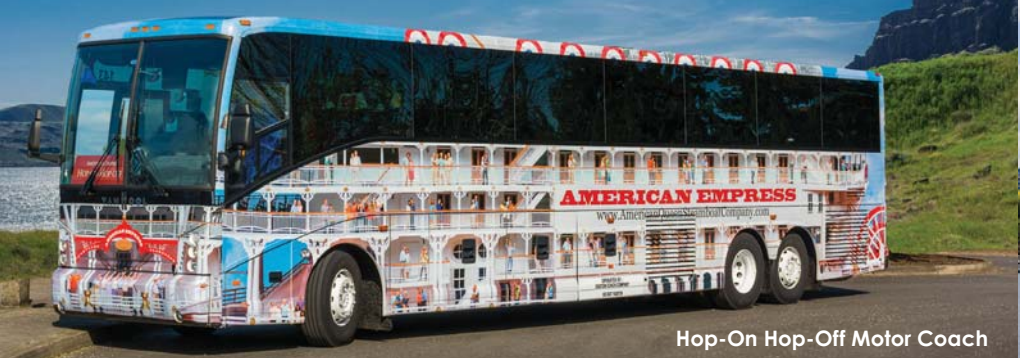
Hop-On Hop-Off Motor Coach