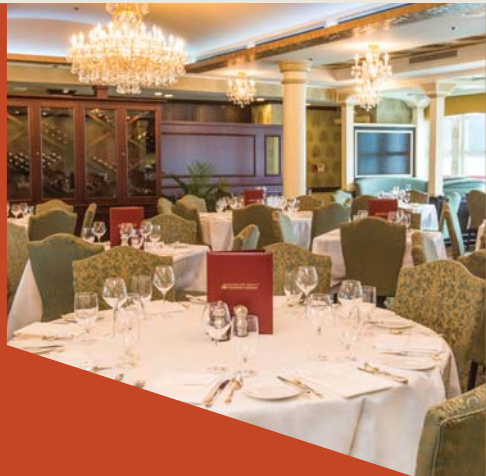
(Pictured right: The Astoria Dining Room)

Night after night, music fills The Show Lounge, elegantly decorated with crystal chandeliers, authentic period-wallpaper, and comfortable seating reminiscent of a lumber baron's estate home. The River Grill & Bar and the Paddlewheel Lounge are meeting points for friends; and The Astoria Dining Room, reflecting the Northwest's rich Russian influence, is graced with romantic columns, sparkling light fixtures, and exquisite upholstery—the perfect backdrop to sample regional dishes.