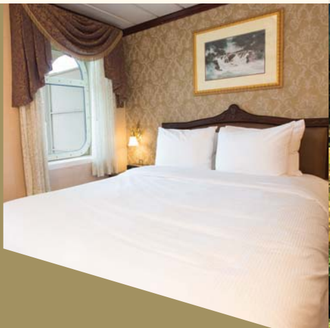
(Pictured right: C Stateroom)

The American Empress is a breathtaking combination of modern comfort and Victorian charm. All suites and staterooms feature a flat-screen TV, mini refrigerator, and coffeemaker, along with extravagant bedding and fine linens and luxury hotel-style service. Take in resplendent scenery as you enjoy a quiet respite in your stylish suite or deluxe stateroom, designed with all the comforts of home. Life aboard the American Empress flows at your pace, according to your taste.