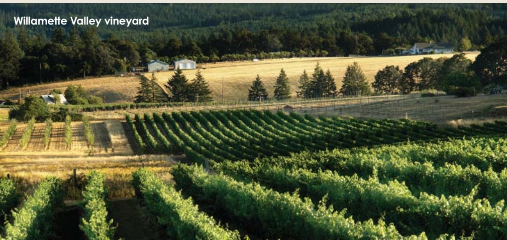
Willamette Valley vineyard

Global Destinations Management, Ltd. and Go Next, Inc. are not responsible for injuries or losses resulting from any causes beyond their own respective and exclusive control. Global Destinations Management, Ltd. and Go Next, Inc. are not responsible for the negligence of the other or any other suppliers or providers. Land accommodations, local transportation, and sightseeing are arranged and operated by Hometown Advantage in Portland and Grape Escape in Willamette Valley, which may use other suppliers or providers to render the services. HOTEL AND SIGHTSEEING ARE SUBJECT TO CHANGE.