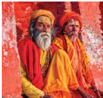
Top: Elephants At The Amber Fort Bottom: Holy Men