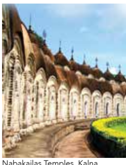
Nabakailas Temples, Kaina

Singles are available in the Colonial Suite for $11,995 and the Signature Suite for $11,195 booked on or before March 11, 2016. *Savings price applies only to reservations made and paid in full by March 11, 2016.