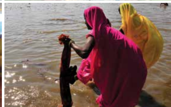
(L to R): Ganges Voyager; Taj Mahal; Dining Room; Viceroy Suite; Outdoor Lounge; Amber Fort, Jaipur