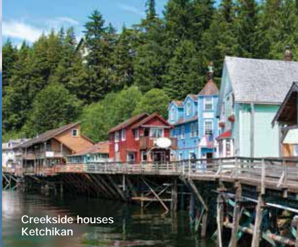
Creekside houses Ketchikan