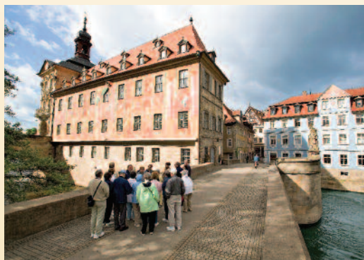
Top: The Middle Rhine Valley, Katz Castle and legendary Loreley | Above: Melk Abbey

has a style that is gracious and elegant yet open and friendly. The Old Town is virtually a separate medieval village with thick, stone walls, meandering streets, half-timbered houses and quaint shops. See the courthouse where the Nuremberg Trials were held, the hilltop Imperial Castle, and the colorful open-air market punctuated by an elegant 14th-century Gothic fountain.