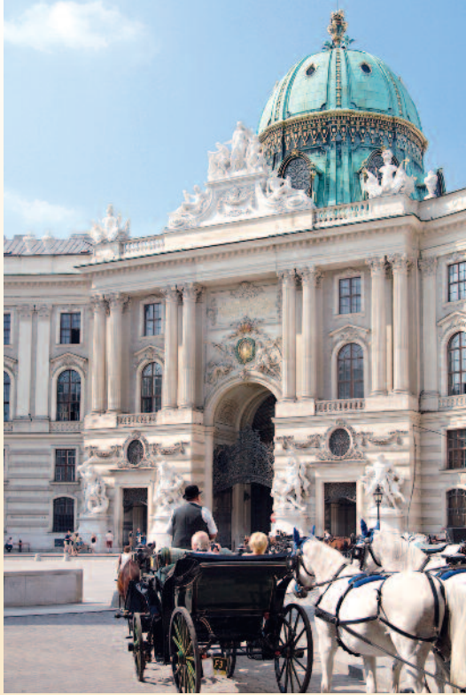
Left: The Imperial Palace, Vienna | Below: Bratislava