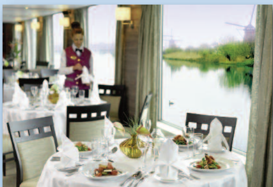
Top: Cabin A-Mozart | Above: View of windmills from the lovely dining room window