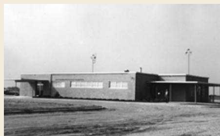
BELOW: Easterwood Airport, then and now.