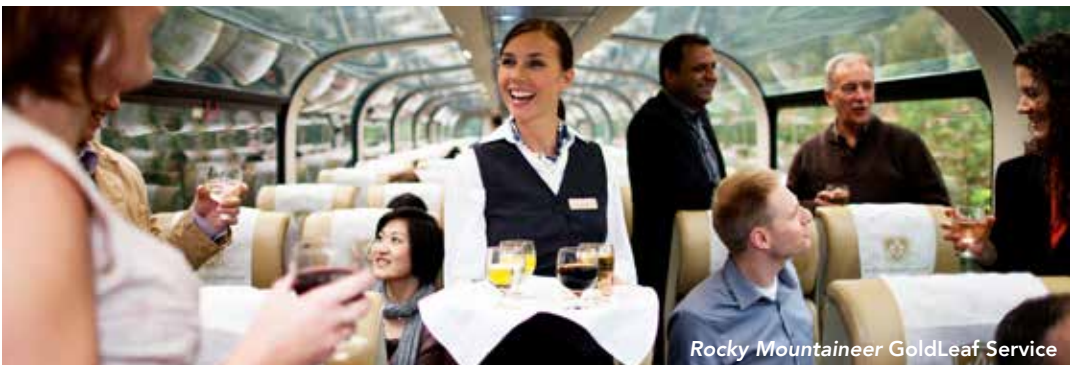
Rocky Mountaineer GoldLeaf Service

GoldLeaf Service: Bi-level dome car with full-length panoramic windows, reclining dome-level seats that rotate to accommodate groups of four, and exclusive meal service and dining room access on the first level with a full galley kitchen offering a gourmet menu with hot food.