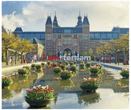
Above: Amsterdam | Inset: Rijksmuseum, Amsterdam

• Breisach and Freiburg. Enjoy a walking tour of beautiful Breisach, full of pastel-colored houses and cobbled lanes. Continue to Freiburg, a university town known for its sunny, warm climate, and see the red sandstone Gothic cathedral and the bustling Augustinerplatz.