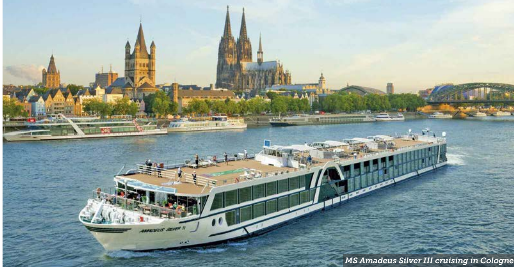
MS Amadeus Silver III cruising in Cologne