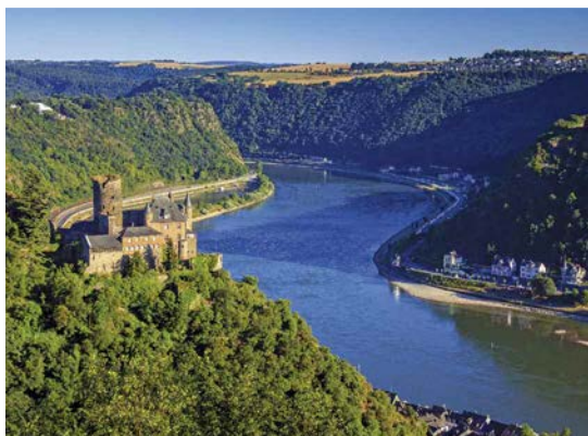
Top: Heidelberg | Above left: Waterland bike ride | Above: Katz Castle near Loreley Rock

its historic gems. Then relish the old-world charm on a guided stroll of the historic center and a visit to Notre Dame Cathedral.