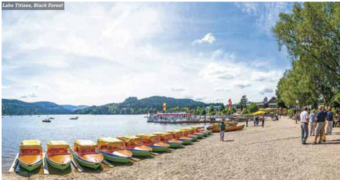
Lake Titisee, Black Forest