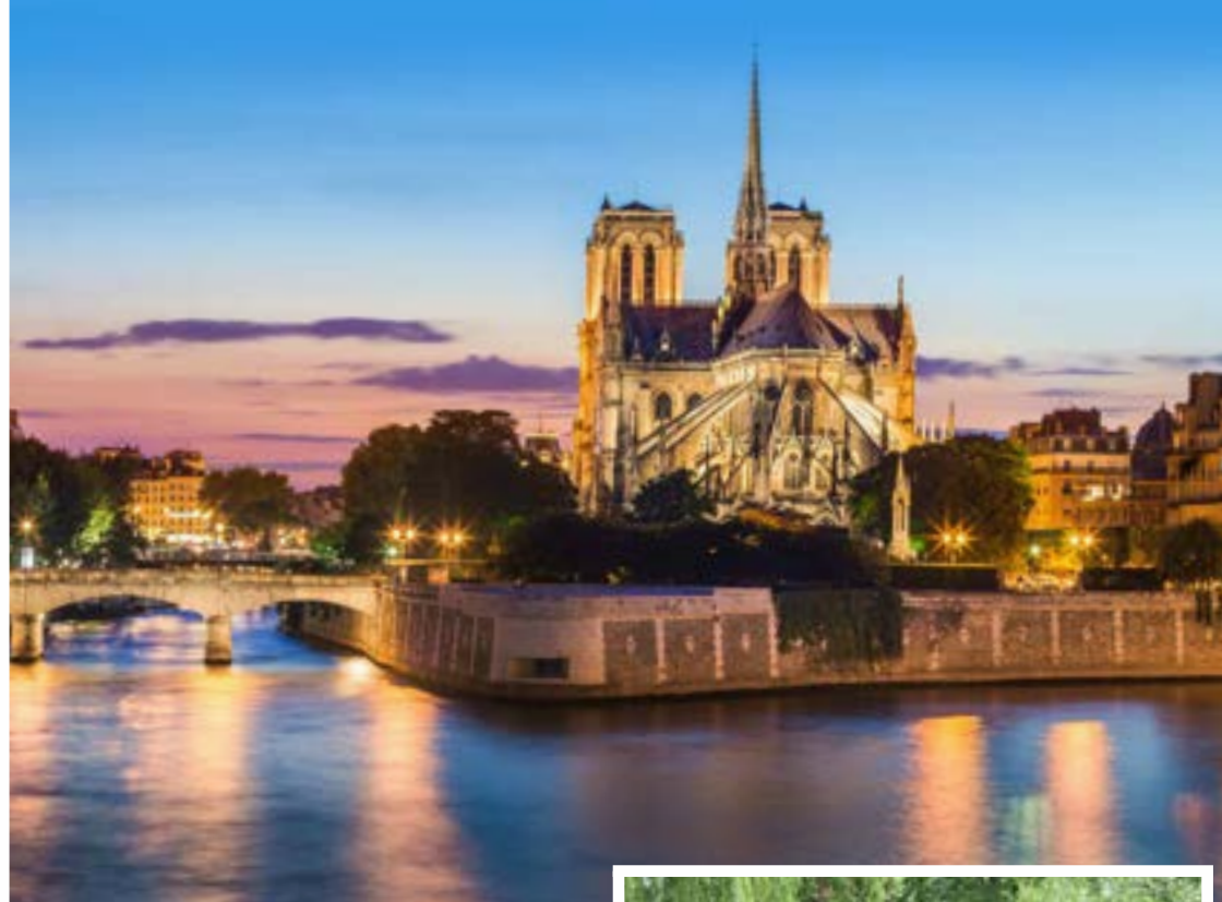
Above: Notre Dame Cathedral | Right: Monet's Garden, Giverny

Discovery: Seine at Night. Tonight, savor a special encounter with the City of Light during an evening illumination cruise on the Seine. Marvel at Paris' many landmarks, including Notre-Dame Cathedral and the Louvre, and float under the graceful arches of centuries-old bridges.