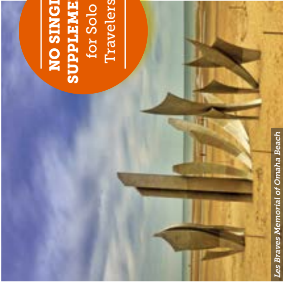
Les Braves Memorial of Omaha Beach