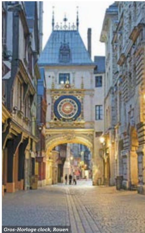
Gros-Horloge clock, Rouen