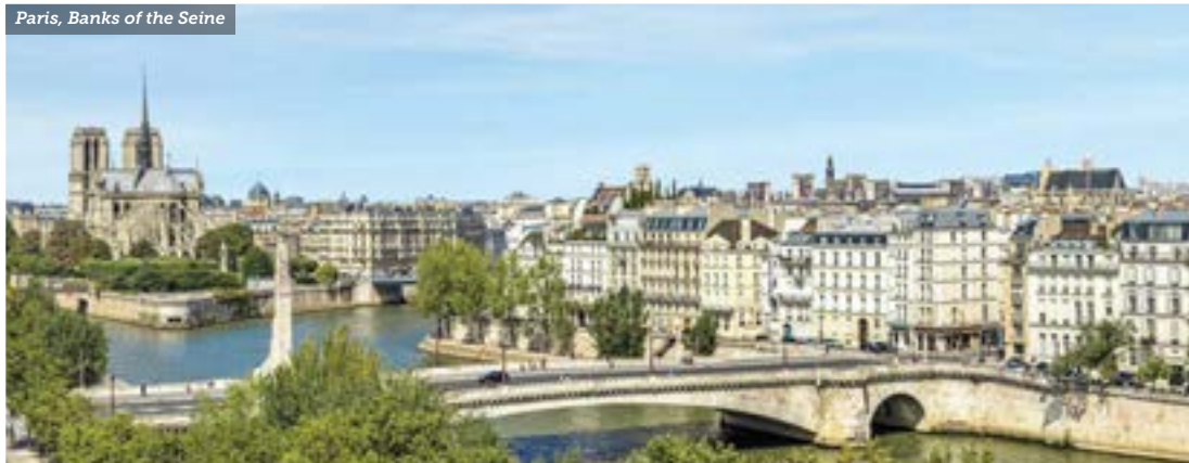
Paris, Banks of the Seine