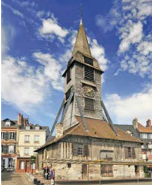
Left: Church of Sainte-Catherine, Honfleur Below: Hall of Mirrors, Versailles | Lower: Abbey de Jumièges