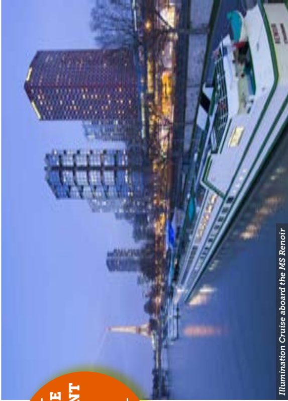
Illumination Cruise aboard the MS Renoir