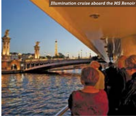
Illumination cruise aboard the MS Renoir