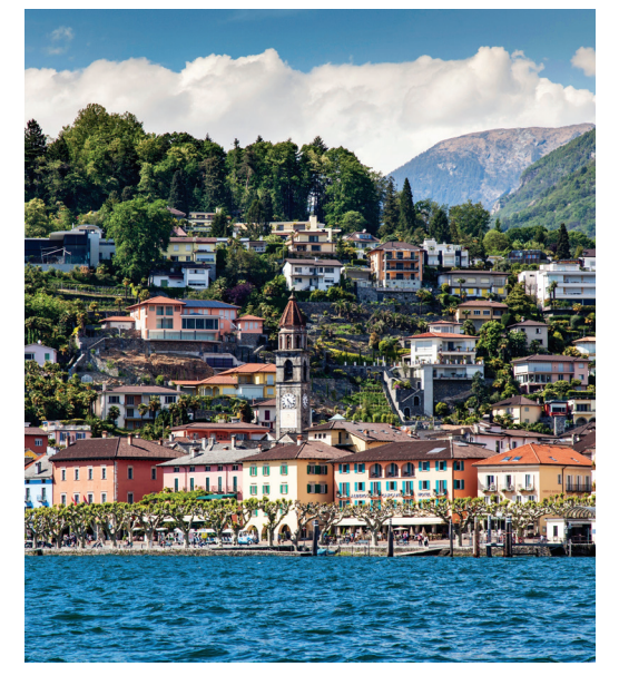
Ascona on the shores of Lake Maggiore