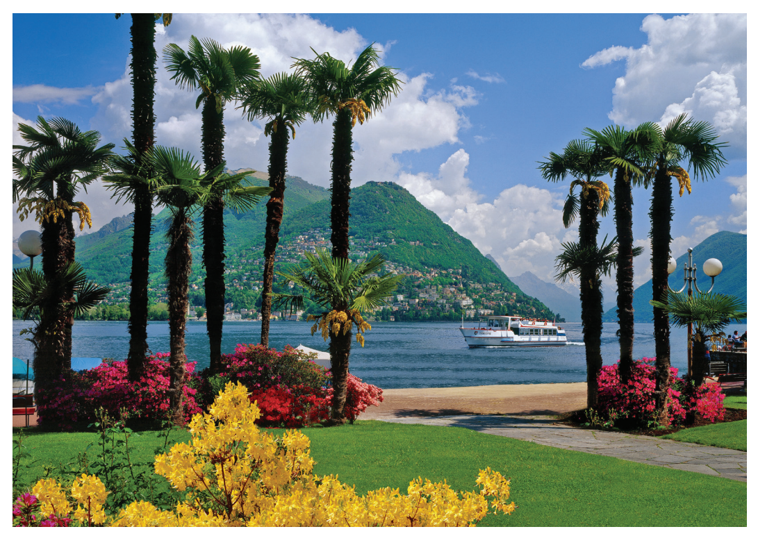
Lake Lugano offers a taste of Italy in Switzerland.

and cross into northern Italy via the legendary Simplon Pass through the Alps. Late morning, we arrive in Stresa, Italy, along the shores of lovely Lake Maggiore, where we have time to explore and enjoy lunch on our own. Then a scenic drive through the famed Italian lake district returns us to Switzerland and our hotel in lakeside Lugano. B , D