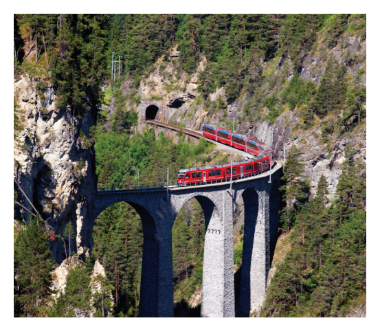
We ride the legendary Glacier Express.

Day 14: Depart for U.S. We transfer today to the Munich airport for our return flight to the U.S. B