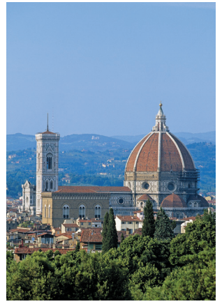
We visit splendid Florence on Day 12.

Day 13: San Gimignano We encounter classic Tuscany today as we visit the hill town of San Gimignano, known for the 13 watchtowers that have left its skyline virtually unchanged since medieval times. Later we visit a local winery and enjoy a tasting be-