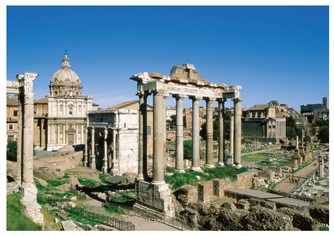
Rome's Forum dates to the 7th century BCE.

Day 7: Rome Another morning of touring followed by a free afternoon. Today we visit the Vatican for a tour of St. Peter's Square and Basilica, and the Sistine Chapel in the Vatican Museums. Highlights include Michelangelo's Pieta in St. Peter's, considered one of the greatest sculptures of all time; his frescoed ceiling of the Sistine Chapel, now restored to its original glory; and art-filled St. Peter's itself, the most important church in all Christendom. B