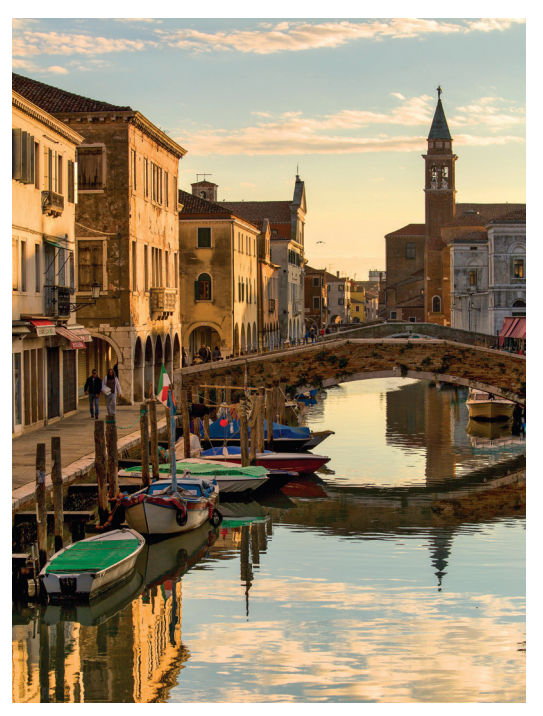
Our tour ends in timeless Venice.