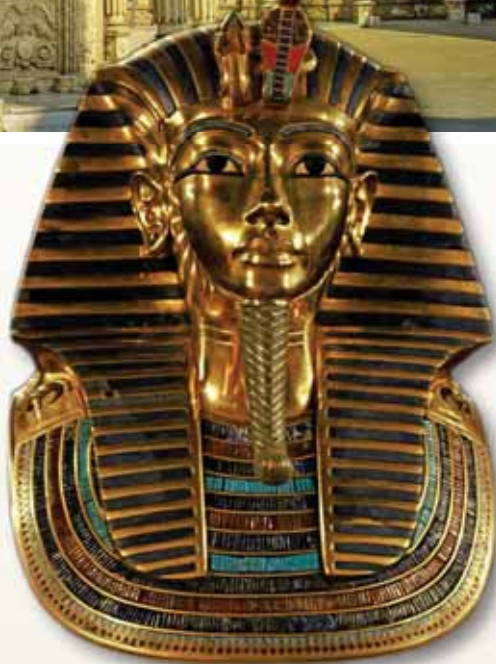
Top: Mosque of Mohammed Ali, Cairo | Above: Burial mask of Tutankhamen

Discovery: The Pyramids of Giza. Today, view the Great Pyramid of Giza, the only surviving monument among the Seven Wonders of the Ancient World. The largest of the three Old Kingdom pyramids in the complex, it was built for the pharaoh Khufu out of approximately 2.3 million massive blocks of stone. Stand before the mystifying, iconic Sphinx that crouches nearby. In the Solar Boat Museum, see a cedar vessel thought to be over 4,500 years old, intended as transportation for a pharaoh in the afterlife.