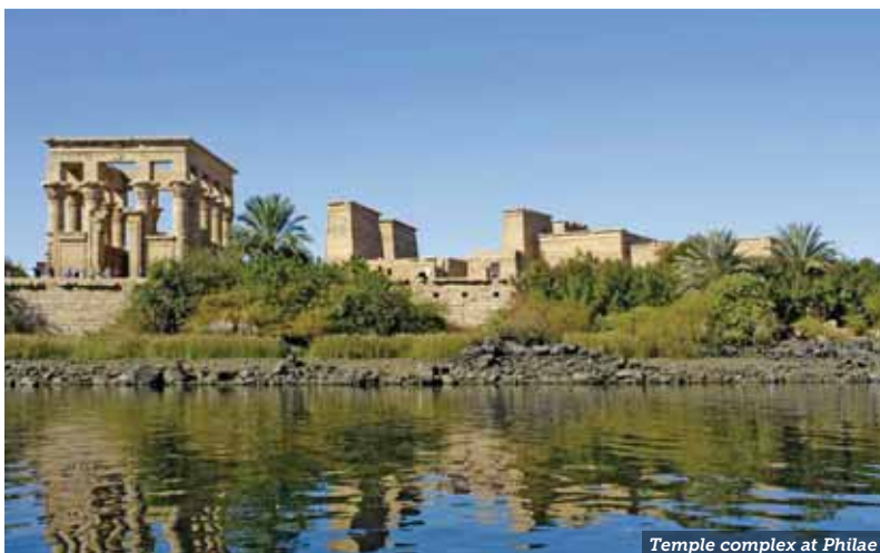
Temple complex at Philae