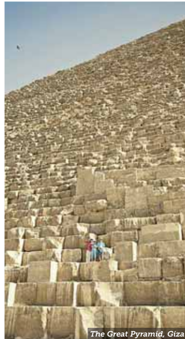
The Great Pyramid, Giza