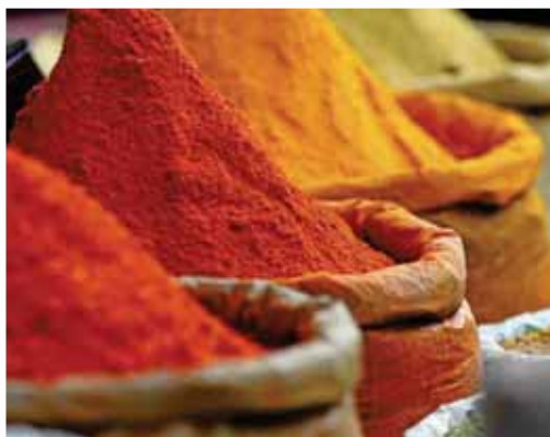
Top: The Sphinx and pyramids of Giza | Left: Cairo | Above: Spices in Khan el Khalili bazaar, Cairo

workshop employing impoverished people, to see beautiful paper being made by hand.