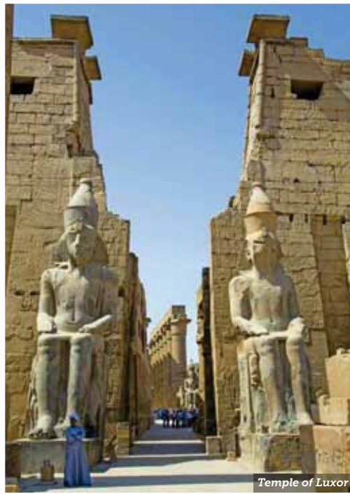
Temple of Luxor

Founded in 1924, the University of Chicago's Oriental Institute's Chicago House has completed epigraphic surveys of important archaeological sites in and around Luxor. The Chicago House Method consists of photographing a surface and printing the image on a coated paper that can be drawn on. After all the details have been sketched, the paper is immersed into an iodine bath that erases the photograph but keeps the drawings, creating a detailed blueprint of the monument and its intricate carvings. Learn about this unique and fascinating process in an exclusive visit specially arranged for you.