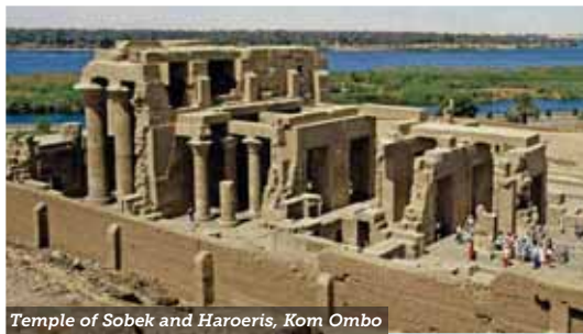
Temple of Sobek and Haroeris, Kom Ombo