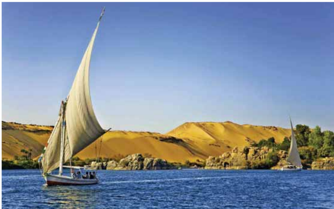
Feluccas on the Nile